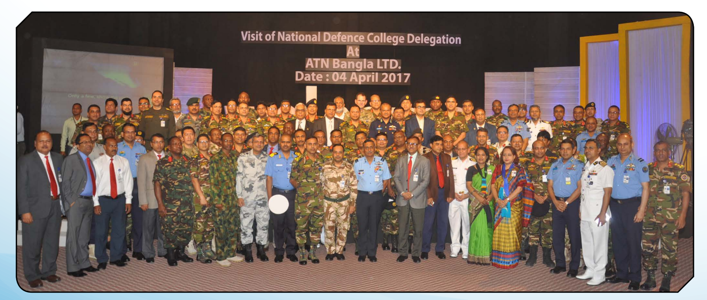
Faculty Members, Staff Officers and Course Members of ND Course 2017 visited ATN Bangla on 04 April 2017 as part of course curricula.