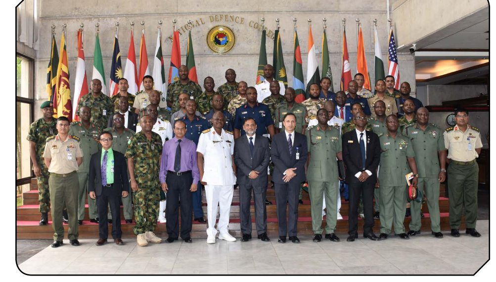
Delegation of National Defence College, Nigeria visited NDC, Bangladesh on 15 May 2017.