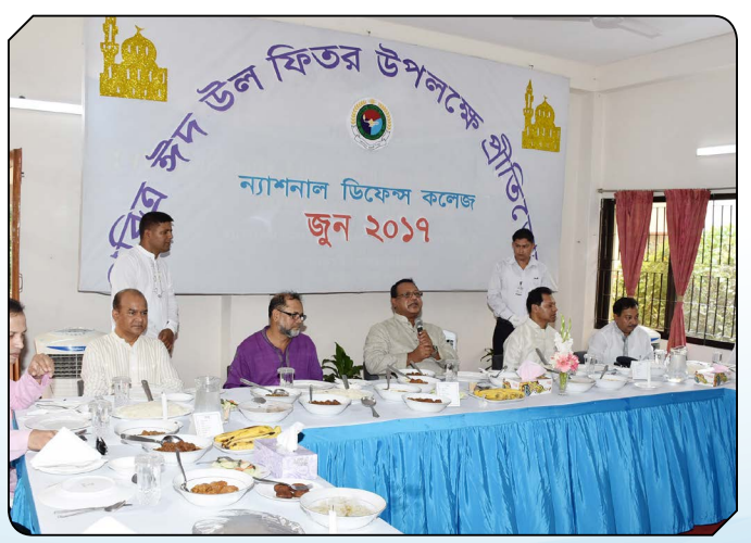
The feast (Eid Pritivoj) arranged on the day of Eid ul Fitr on 26 June 2017.

Faculty Members, Staff Officers and Course Members of Armed Forces War Course 2017 visited 6 Independent Air Defence Artillery Brigade on 18 April 2017 as part of course curricula.