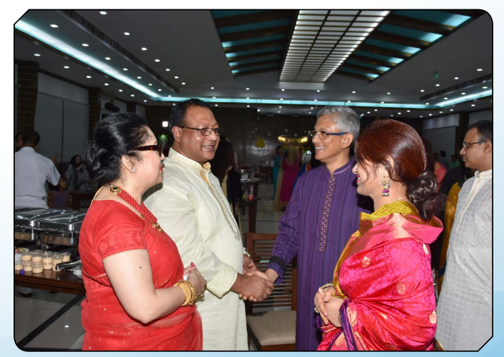
Eid ul Fitr reception at NDC on 26 June 2017.