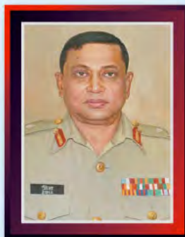
Lt Gen Sina Ibn Jamali, awc, psc 14 May 2009 to 31 Oct 2009