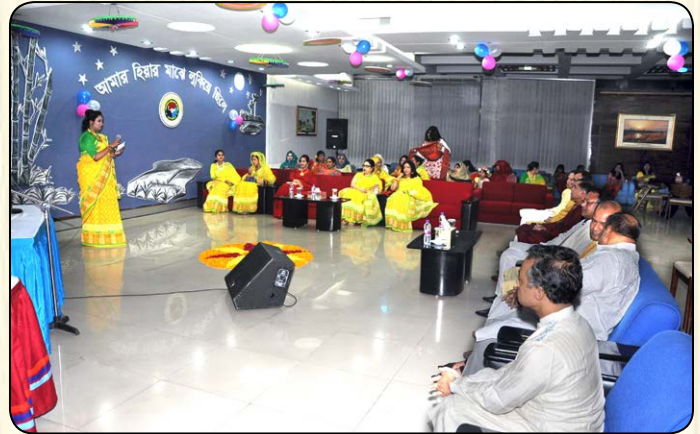
NDC Ladies Club organized "Spring Festival" to mark the colourful season of spring on 14 February 2017.