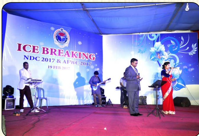
An ice breaking ceremony was organized on 19 February 2017 jointly by the Course Members of ND Course 2017 and AFWC 2017 to mark the motion of the year long courses.