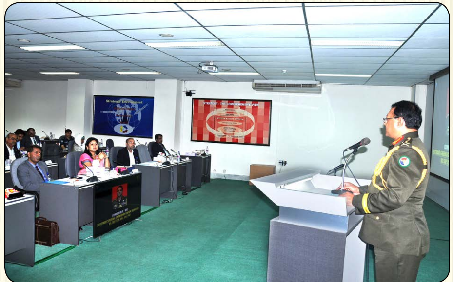
Commandant NDC, Lt Gen Chowdhury Hasan Sarwady, BB, SBP, BSP, ndc, psc, PhD delivering a lecture on “Civil Military Relations and Role of Armed Forces in National Security and Development” on 14 February 2017 to the Fellows of Capstone Course 2017-1. He also delivered lecture on “Defence Policy of Bangladesh” on 19 February 2017.