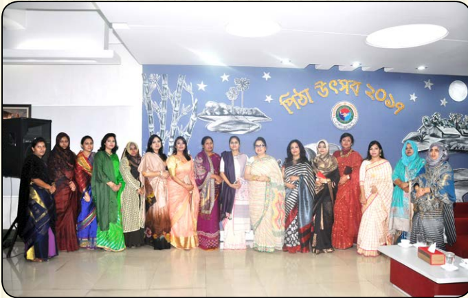
NDC Ladies Club Organized Pitha Utshob on 24 January 2017.