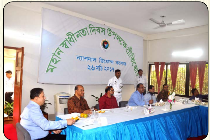
Celebration of Independence Day of Bangladesh on 26 March 2017.