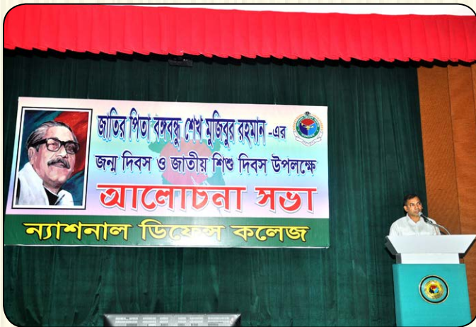
The 98 th birth anniversary of the Father of the Nation, Bangabandhu Sheikh Mujibur Rahman was observed with due respect and honour on 17 March 2017 at NDC.