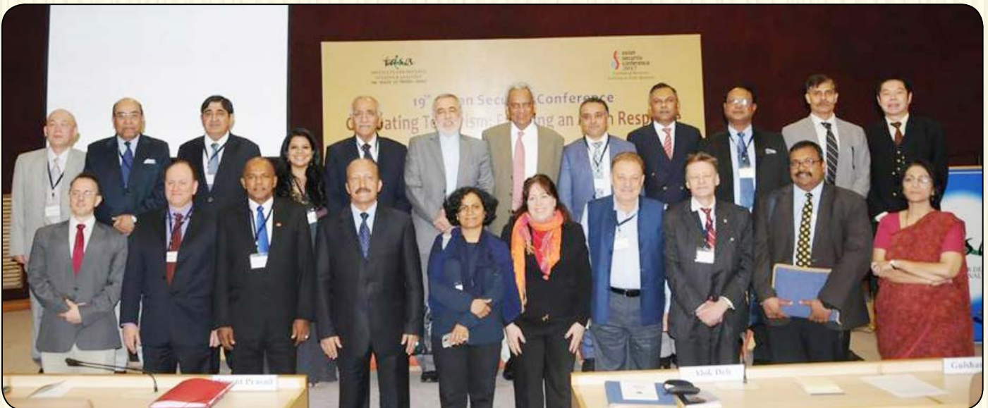
Commandant, NDC along with eminent participants and keynote speakers of "19 th Asian Security Conference 2017" at Institute for Defence Studies and Analyses (IDSA), New Delhi.

Commandant, NDC presented a Keynote Paper on "Combating Terrorism: Evolving an Asian Response" during the 19 th Asian Security Conference 2017 organized by Institute for Defence Studies and Analyses (IDSA), New Delhi on 06-08 March 2017.