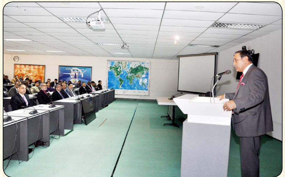
Lieutenant General A K Sahni, UYSM, SM, VSM (Retd), Indian Army, delivered an opportunity lecture on Cyber Security to the National Defence Course 2017 on 26 February 2017.