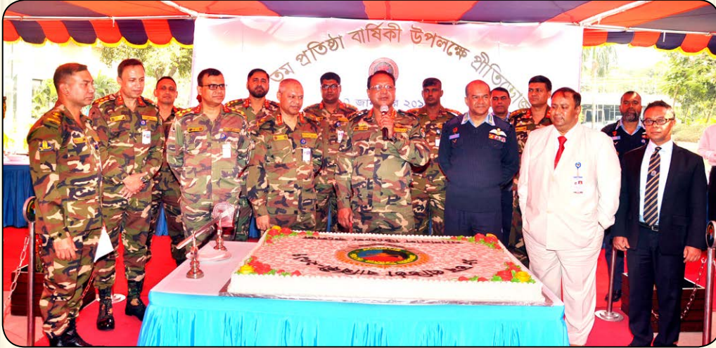
Commandant, NDC along with Faculty Members and Staff Officers knifing the Raising Day Cake on 10 January 2017.

18 th Raising Day of NDC was celebrated on 10th January 2017. A day long Programme was organized to mark this occasion.