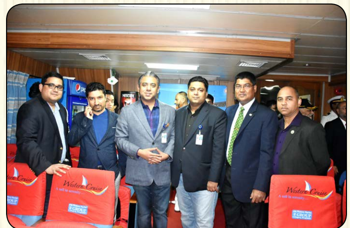
As part of course curricula Faculty Members & Staff Officers of NDC and Fellows of Capstone Course 2017-1 visited various Armed Forces installations during the course. The visit included Armed Forces Division, HQ 24 Infantry Division, BAF Base Bangabandhu and Rangamati Hill District Council.