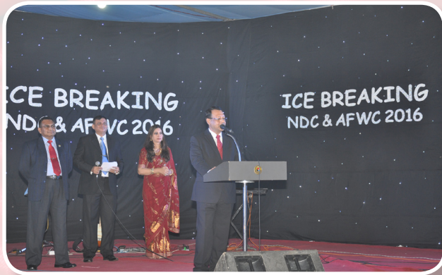
An ice breaking programme had been organized on 17 February 2016 jointly by the Course Members of ND Course 2016 and AFWC 2016.