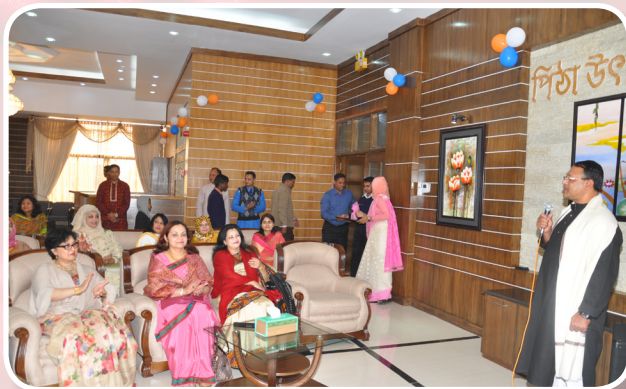
NDC Ladies Club Organized Pitha Utshob on 25 January 2016