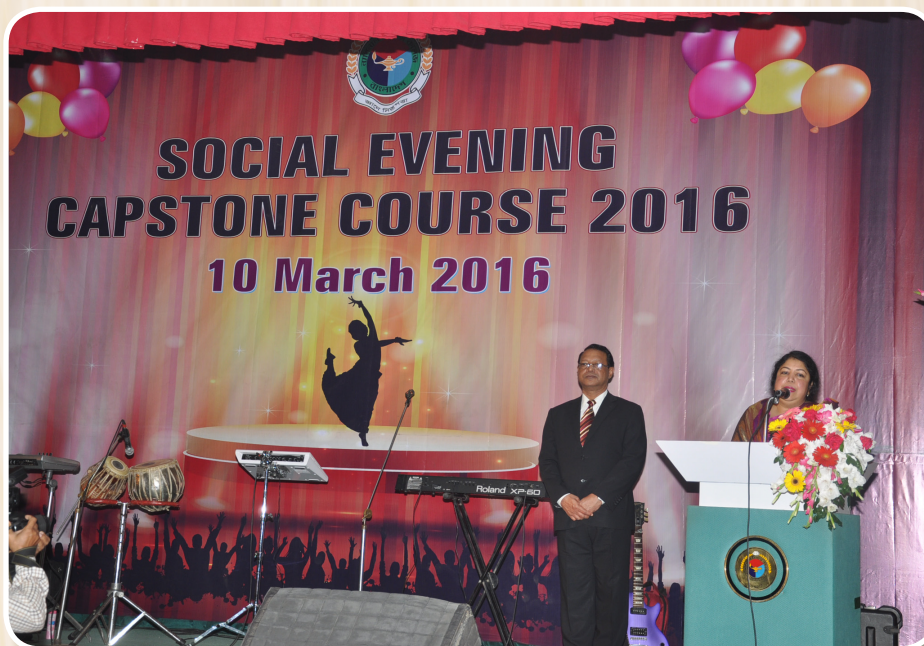
Hon'ble Speaker, Bangladesh Parliament Dr. Shirin Sharmin Chaudhury, MP had graced the occasion as chief guest on 10 March 2016 in the social evening, organized by Capstone Course 2016.