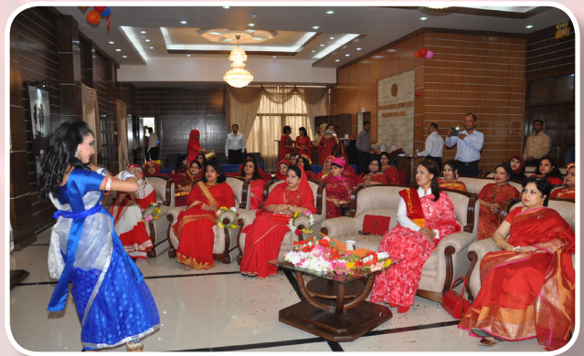
NDC Ladies Club Organized Valentine's Day programme on 14 February 2016