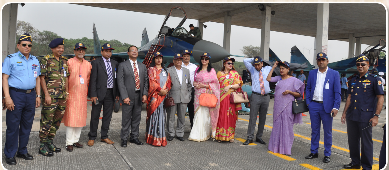
As part of course curricula Faculty & Staff of NDC and Fellows of Capstone Course 2016 had visited various Military and Para-Military installations during the course. The visit included 9 Infantry Divisional Area, Naval Forward Base Saint Martin Islands, BAF Base Bangabandhu and Ansar Academy.