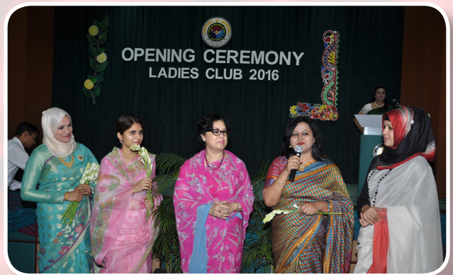
Opening Ceremony of Ladies Club 2016 held on 23 February 2016