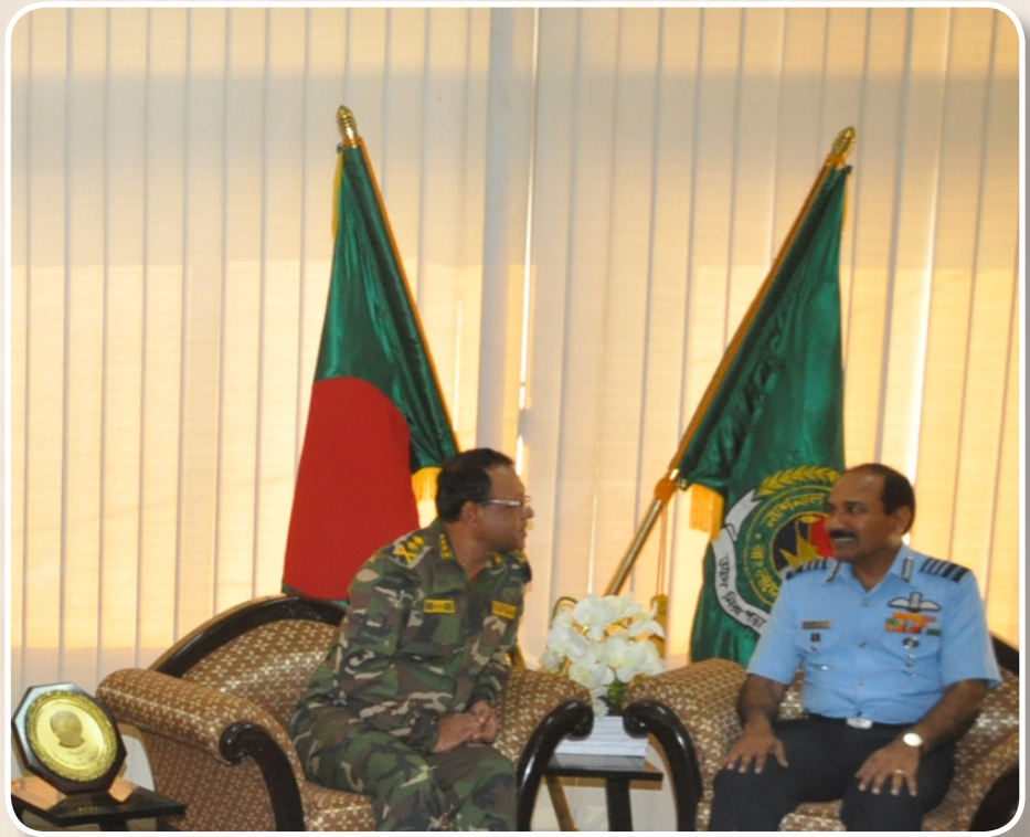
Air Chief Marshal Arup Raha, PVSM, AVSM, VM, ADC, The Chief of Air Staff of Indian Air Force, had visited NDC and called on Commandant, NDC on 25 February 2016.