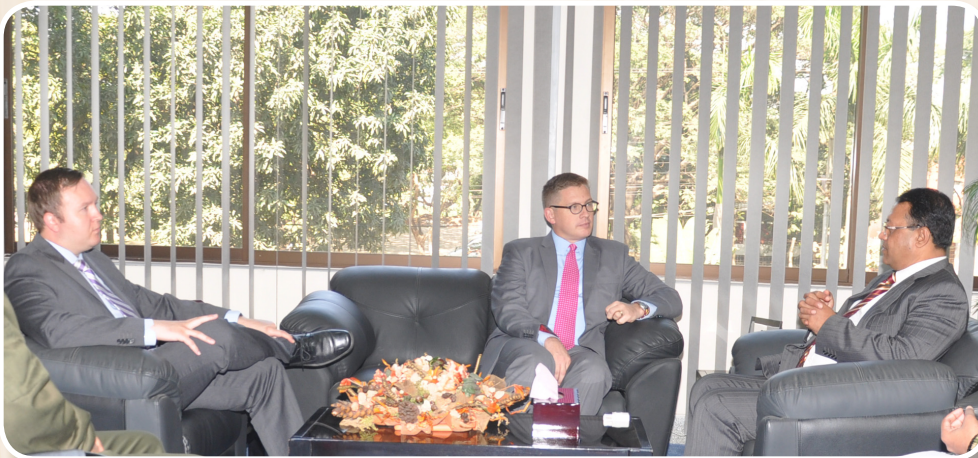
A two members delegation team lead by Lt Col Michael C. Rembold, Defence & Army Attache of USA Called on Commandant, NDC on 25 January 2016. They had discussed various bilateral issues related to conduct of training and education on defence, security, strategy and development studies