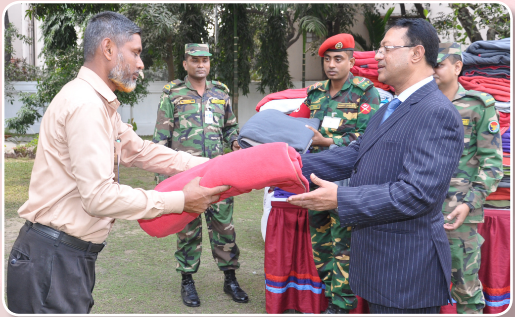
Commandant, NDC had distributed warm clothes among the civilian employees of NDC on 07 January 2016.