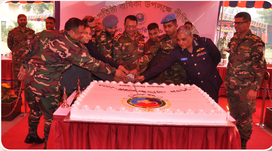
Commandant, NDC along with Faculty and Staff had sliced the Raising Day Cake on 10 January 2016

Raising Day Cultural Programme on 10 January 2016