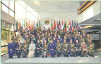
ND Course - 2015