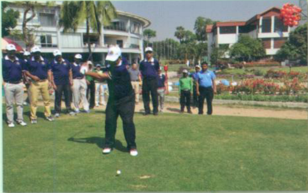
Shot of the Day!

Various sports competitions like cricket, tennis, golf and volleyball are organized by the college in order to provide much needed relief