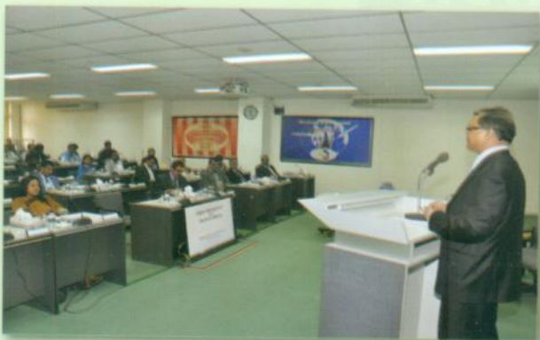
Cabinet Secretary in a session with Capstone Course