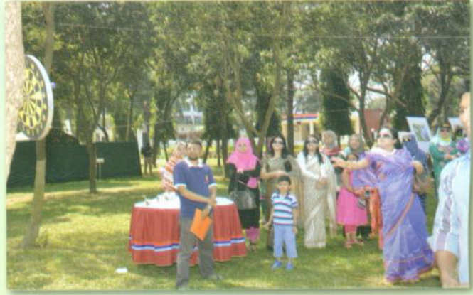
Ladies targeting Bull's Eye in Annual Picnic