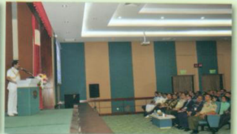
Indian Navy Chief in a joint session with ND Course and AFWC