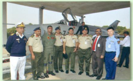
ND Course at BAF Base Bangabandhu