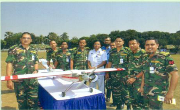
AFWC visiting AD Brigade