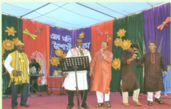
Esho Mati Baishakhe : 1422