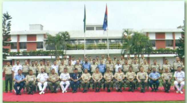
AFWC at Armed Forces Division