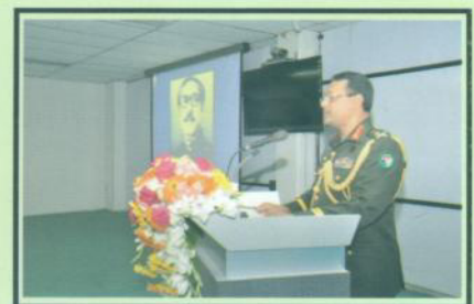
Opening Speech by Commandant for Capstone Course - 2015