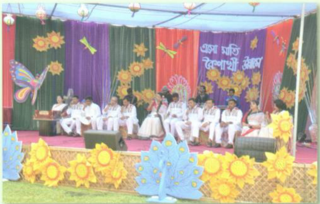
Welcoming Bangla New Year - 1422