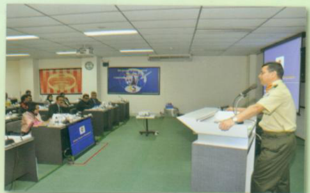
Principle Staff Officer, AFD in a session with Capstone Course