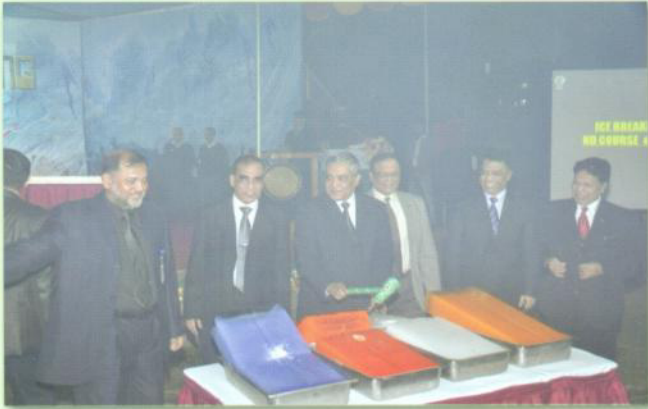
Ice Breaking - A Special Moment

Social programmes are arranged for course members and families in order to make life at NDC more enjoyable