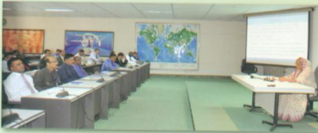
Agriculture Minister interacting with the course members of ND Course

Ministers, members of parliament, senior military officers, academicians, intelligentsia, business leaders, technocrats, ambassadors and high commissioners are invited to share their multi-dimensional experience, knowledge and wisdom through lectures, open discussions and interactive sessions