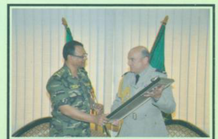
Commandant with VCDS, UK