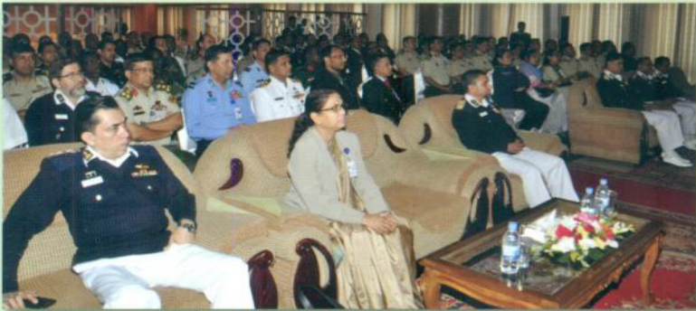
ND Course at NHQ

Internal study tours are aimed at providing an in-depth understanding of the state organs, security and defence organizations, business world, non-government and social institutions, industrial base as well as the culture and traditions of Bangladesh