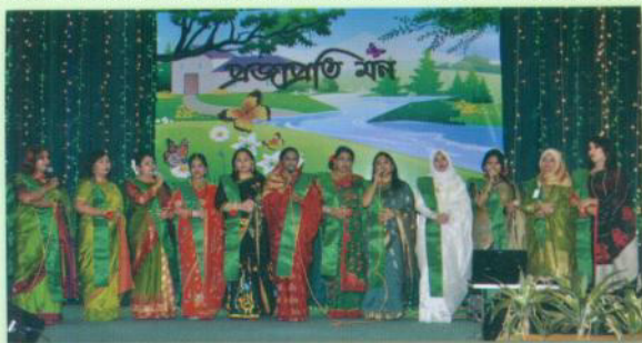
Performers of Ladies Club Programme