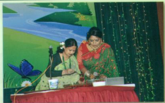
Developing expertise away from home