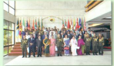
Capstone Course - 2015