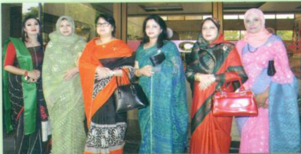
Chair Person with Committee of NDC Ladies Club

Ladies Club programme is an attraction for families of both Bangladeshi and allied course members