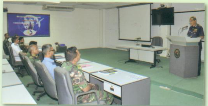
COAS with his vision to AFWC