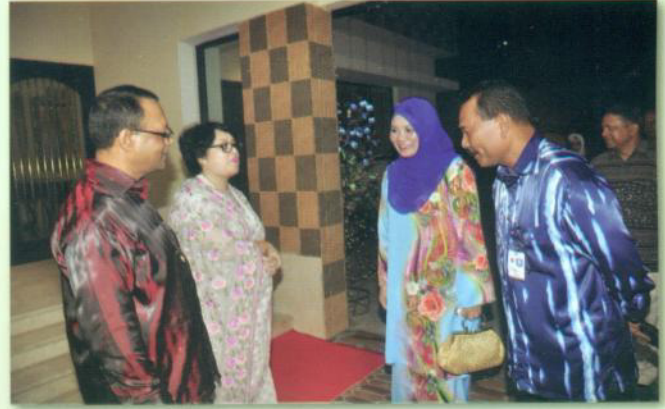
A glimpse of Commandant's Garden Party