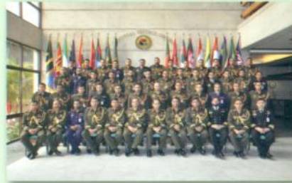
AFWC - 2015