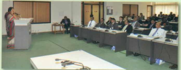
Speaker of the Parliament in a session with ND Course