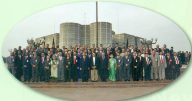
ND Course at the National Parliament