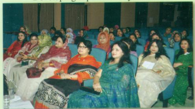
Audience in Ladies Club Programme