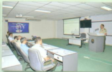
Commandant, NDC delivering lecture to AFWC