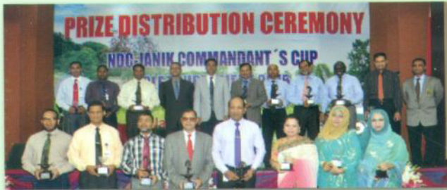
The winners at Golf Tournament