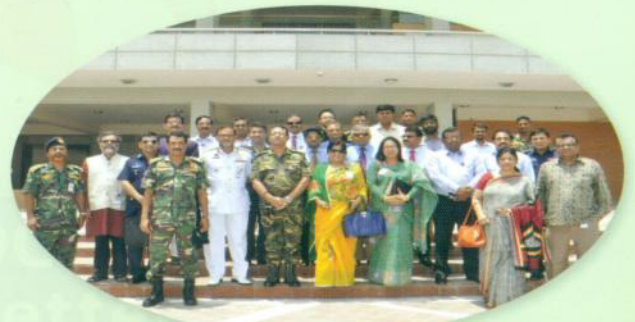
Capstone Course at BJMB Area