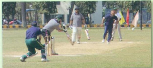
Special Moment in Cricket Tournament