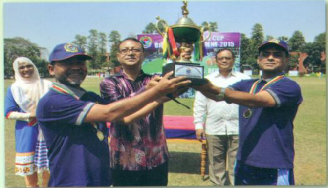
ND Team receiving Champion Trophy