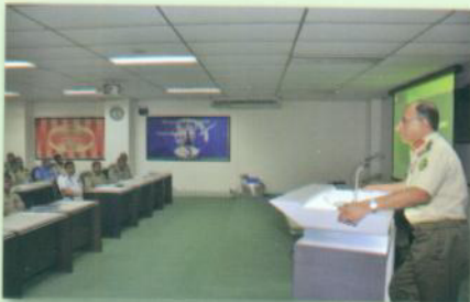
CGS delivering lecture to AFWC