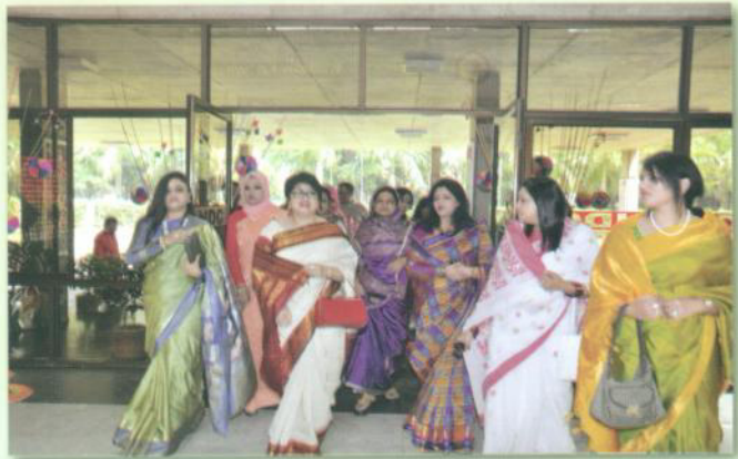
Senior Ladies in Pohela Baishakh