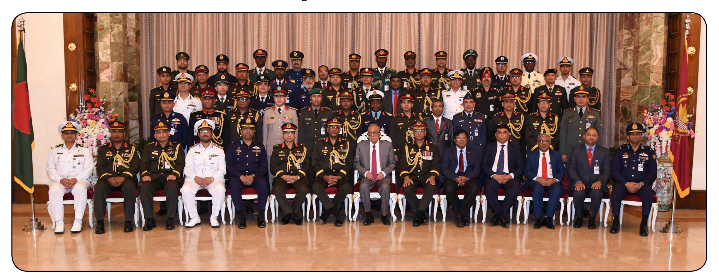
Faculty Members, Staff Officers and Course Members of National Defence Course-2019 and Armed Forces War Course-2019 visited Bangabhaban on 05 December 2019