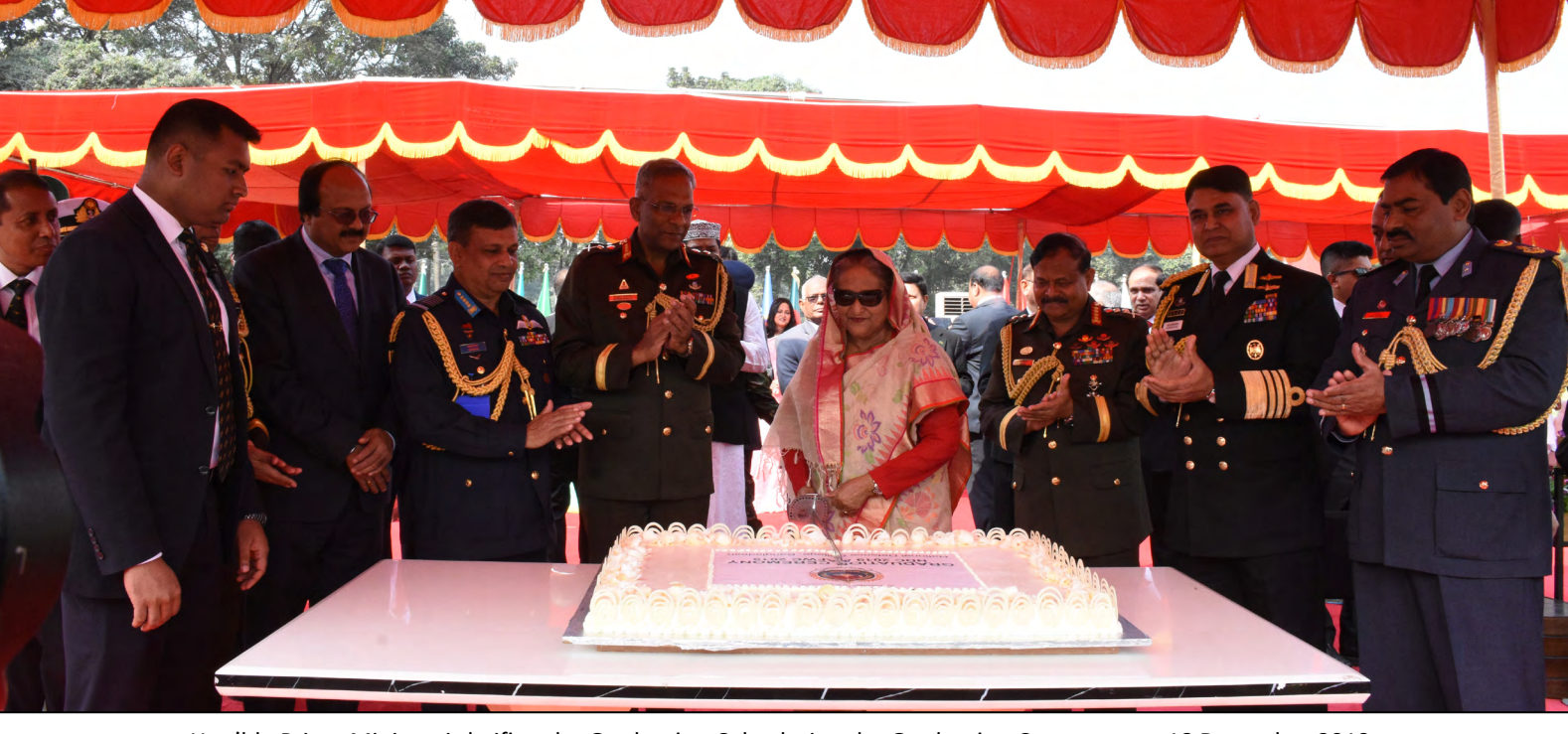
Hon'ble Prime Minister is knifing the Graduation Cake during the Graduation Ceremony on 18 December 2019.