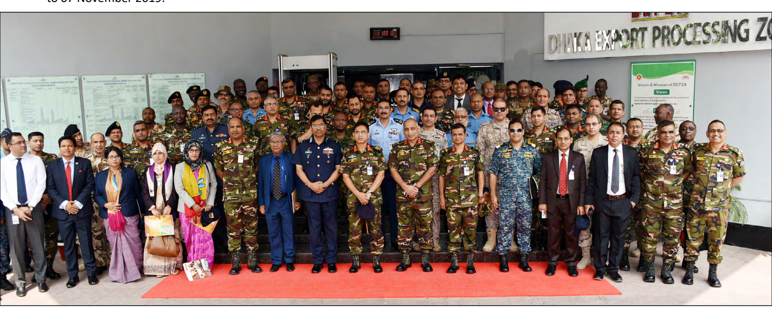
National Defence Course-2019 visited Dhaka Export Processing Zone on 22 October 2019.