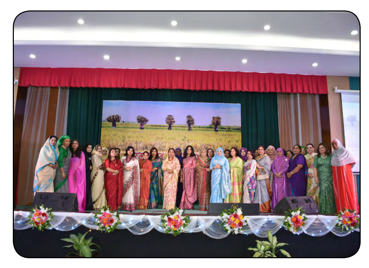
NDC Ladies Club organized "One Dish Party" on 26 November 2019.