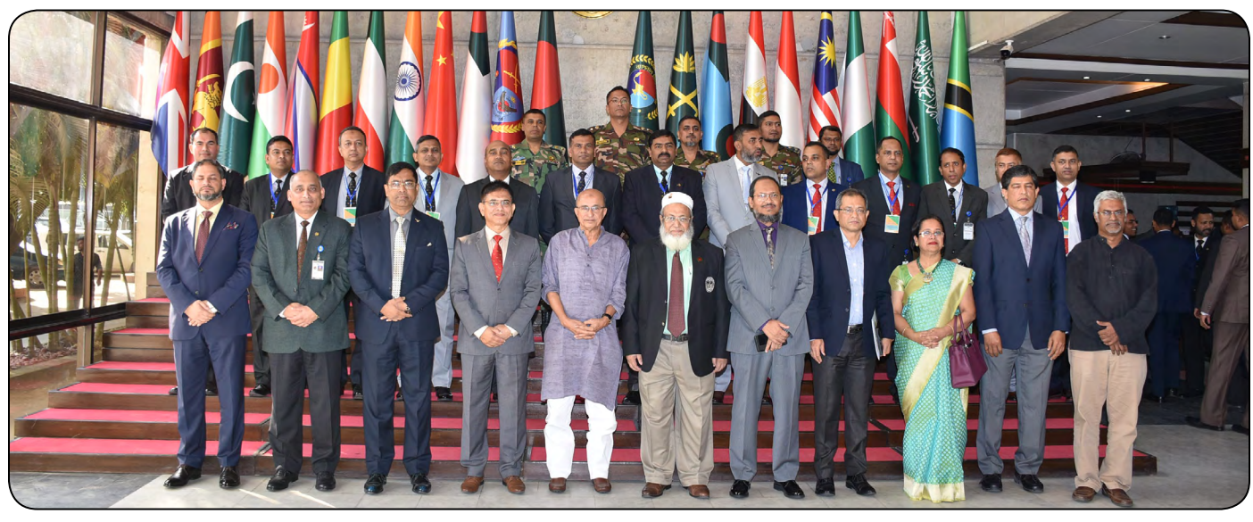
The Chief Guest along with Faculty Members, Moderators, Keynote Speakers and Rapporteurs during the seminar on 28 November 2019 at NDC, Mirpur.