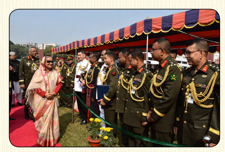
The Hon'ble Prime Minister interacting with the Course Members during the Graduation Ceremony of National Defence Course and Armed Forces War Course 2019.