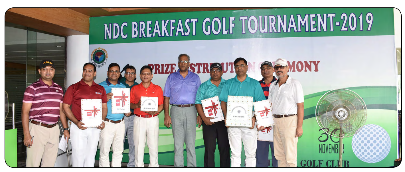
NDC Breakfast Golf Tournament was held on 30 November 2019.