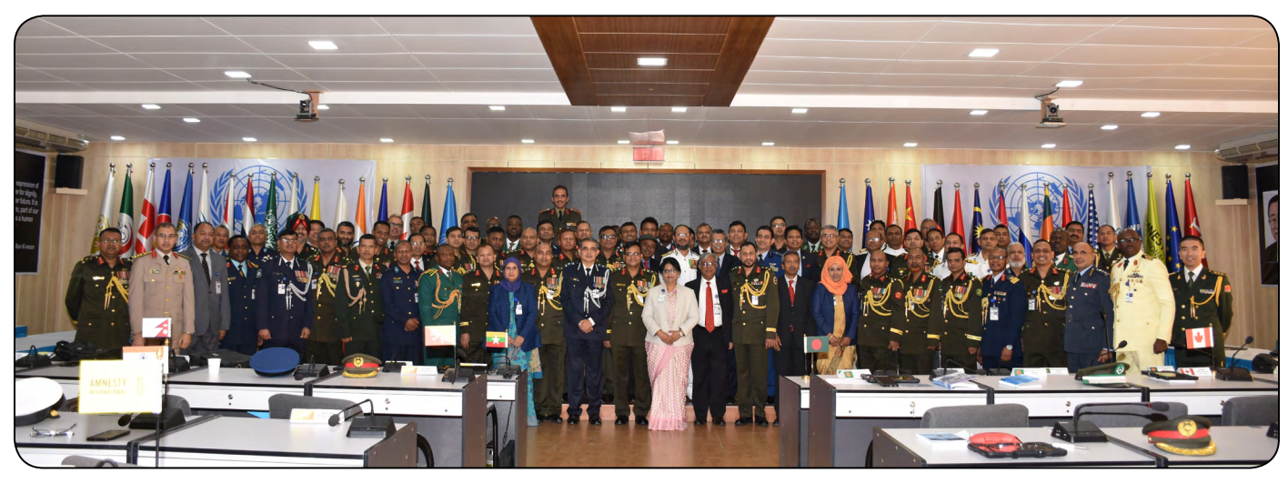
Course Members of ND Course-2019 attended "Exercise Dire Straire" on 17 November to 21 November 2019, where they practiced negotiation in a international scenario.