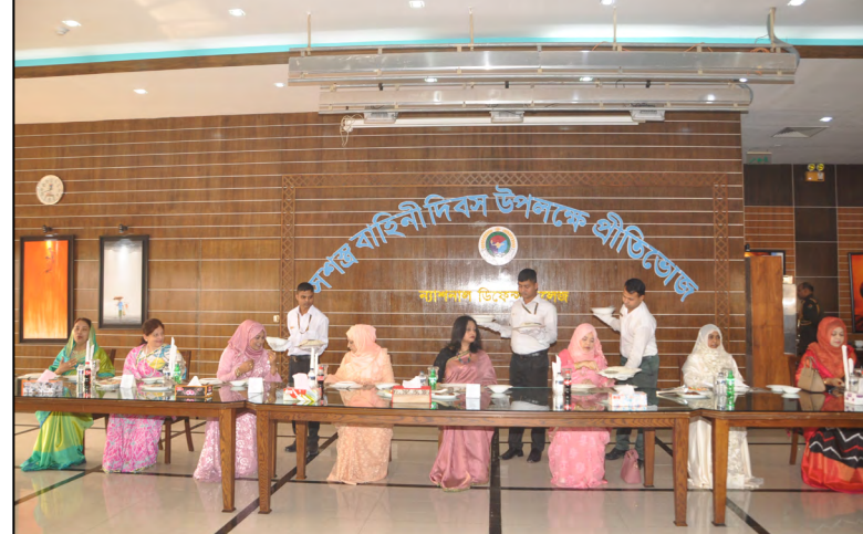
Celebration of Armed Forces Day on 21 November 2019.