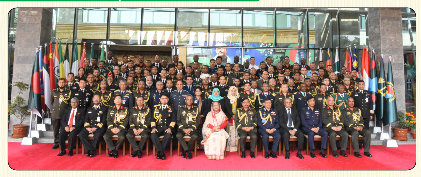
Hon'ble Prime Minister, Government of the People's Republic of Bangladesh, Sheikh Hasina along with Commandant, Faculty Members and Course Members of National Defence Course 2019.