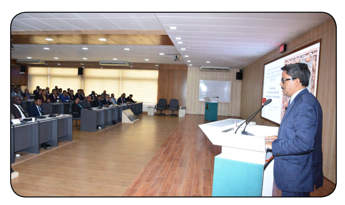
Mr. Md Shahrar Alam, MP, Honourable State Minister for Foreign Affairs delivered a lecture on "The Future of International Relations: New Frontiers and Emerging Paradigm Shift in Diplomacy" to the Course Members of ND Course-2019 on 10 October 2019.