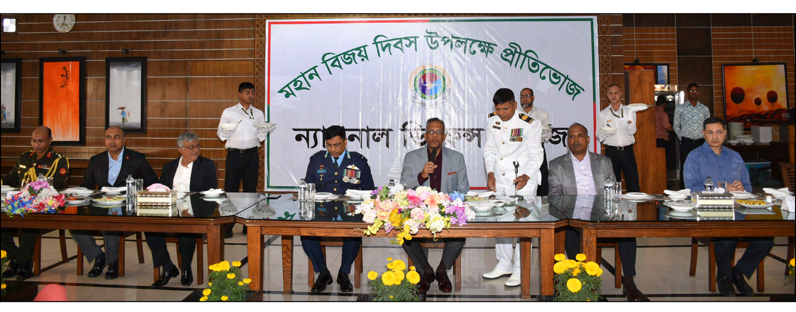
Celebration of Victory Day on 16 December 2019.