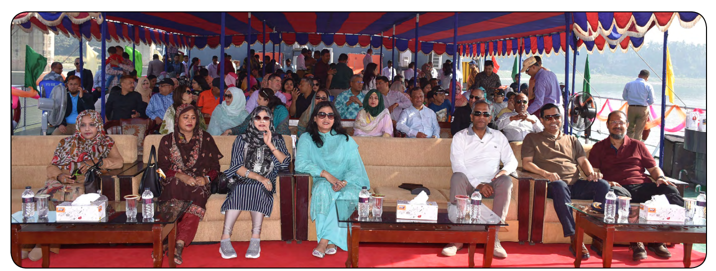
River cruise on River Buriganga-Meghna was made on 07 December 2019.