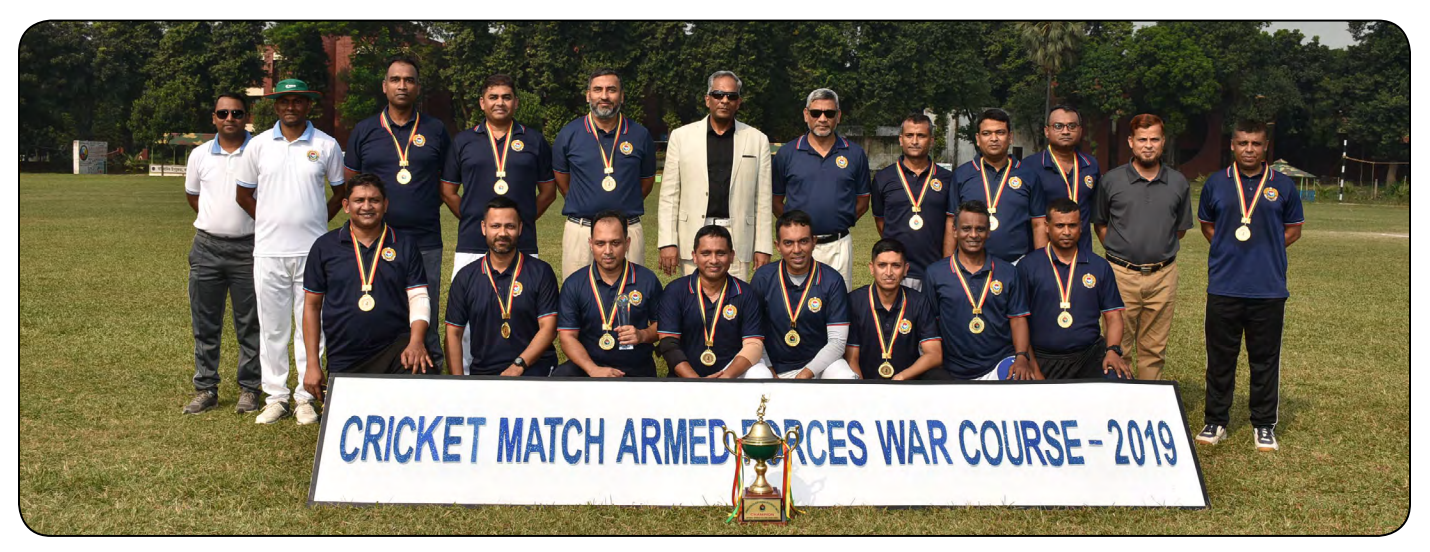
A friendly cricket match was held between Syndicate 1 & 3 and Syndicate 2 & 4 of Armed Forces War Course 2019 on 30 November 2019.