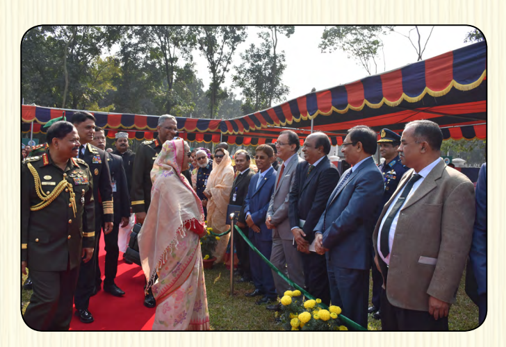
The Hon'ble Prime Minister interacting with the guests during the Graduation Ceremony of National Defence Course and Armed Forces War Course 2019.