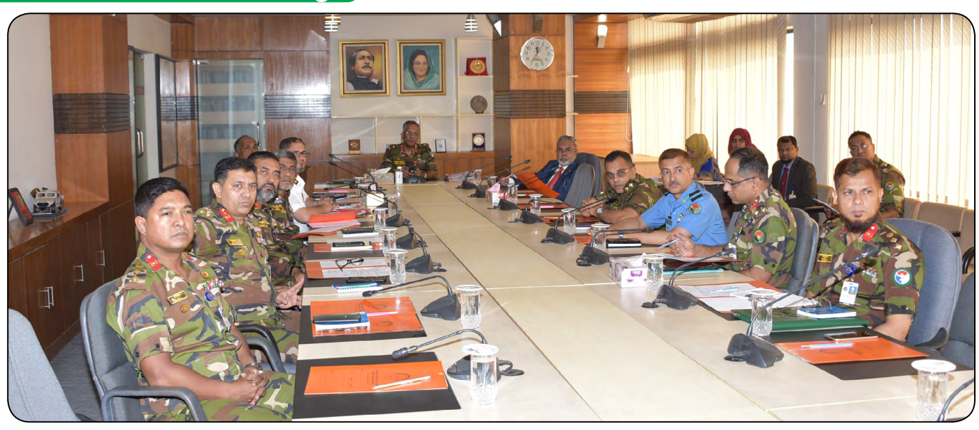
30th Academic Council meeting of NDC was held on 24 November 2019. Commandant, NDC chaired the meeting where Faculty, Staff Officers and Representative from BUP were present.