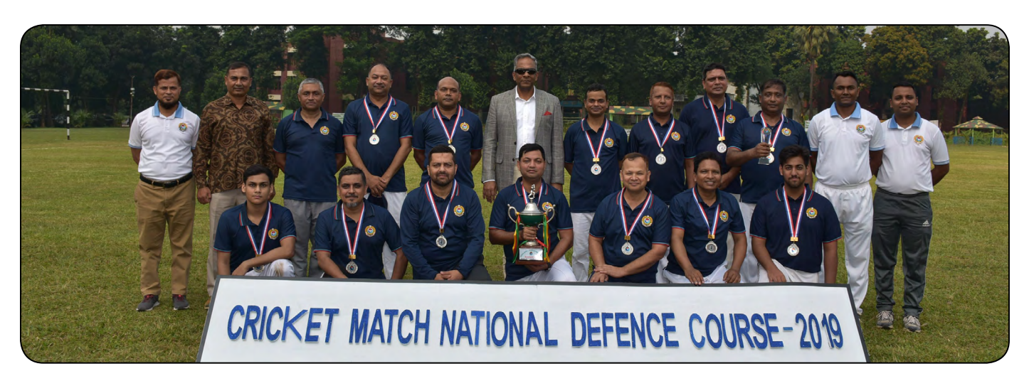
A friendly cricket match was held between Syndicate 1 & 4 and Syndicate 2 & 3 of National Defence Course 2019 on 23 November 2019.