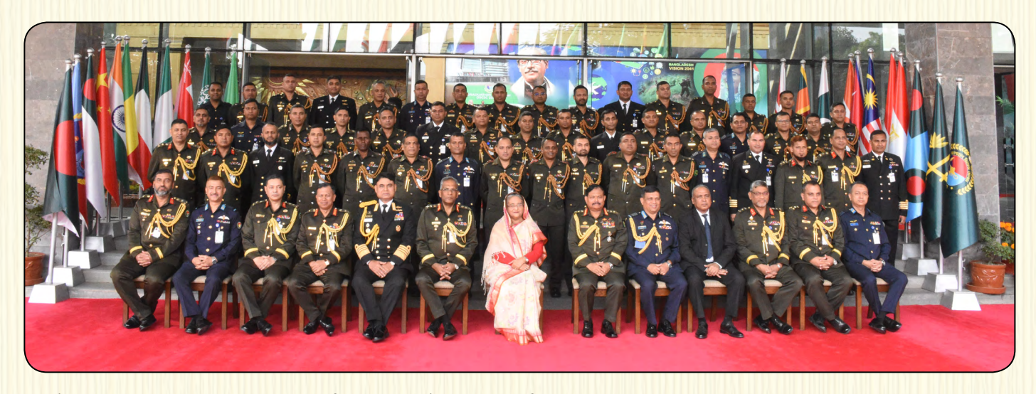
Hon'ble Prime Minister, Government of the People's Republic of Bangladesh, Sheikh Hasina along with Commandant, Faculty Members and Course Members of Armed Forces War Course 2019.