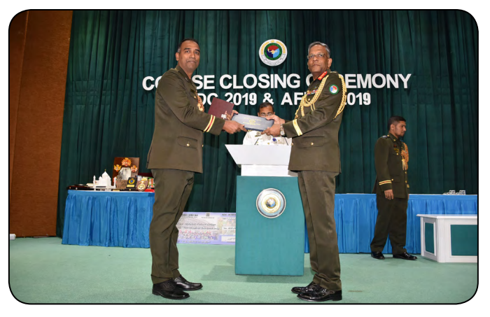
Commandant NDC, handed over the best IRP Awards among the participants of National Defence Course-2019 and Armed Forces War Course-2019 during the course closing address on 10 December 2019.