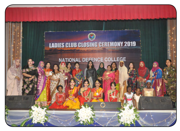
NDC Ladies Club Closing Ceremony was held on 08 December 2019.