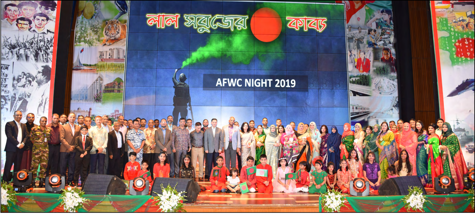
AFWC Night, a gala event of National Defence College was on 05 September 2019 at Sheikh Hasina Complex, DSCSC. Commandant, Faculty Members, Staff Officers and all Course Members attended the occasion.