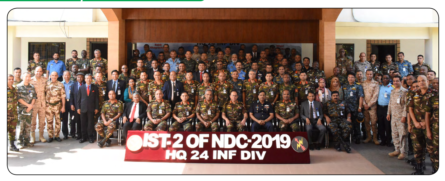
Faculty Members, Staff Officers and Course Members of National Defence Course-2019 visited Chattogram area from 02 November to 07 November 2019.