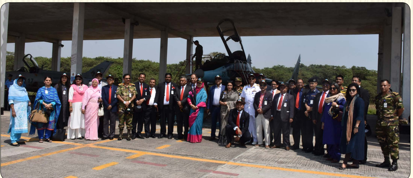
Capstone Course at BAF Base Bangabandhu.