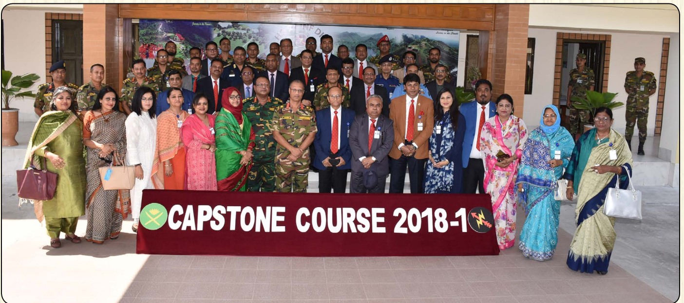
Capstone Course at Headquarters 24 Infantry Division.

Fellows of Capstone Course 2018-1 participating in an interactive session on "Progress of Implementation of Peace Treaty and Development of Chittagong Hill Tracts" during their visit at Bandarban Hill District Council.