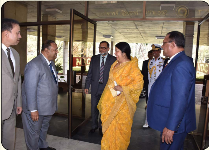
While receiving Hon'ble Speaker during her visit to NDC as Guest Speaker.