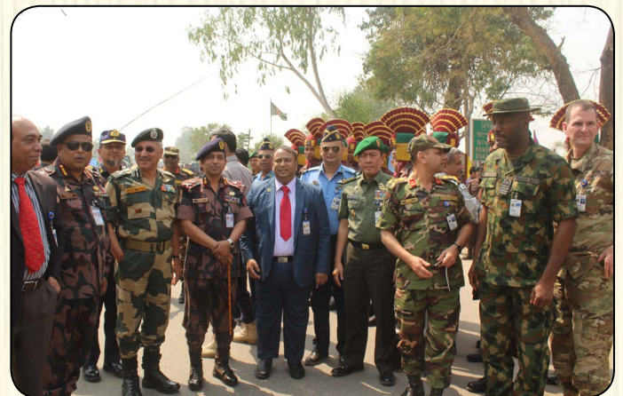
While visiting Jashore with ND Course.