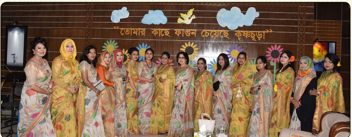
NDC Ladies Club organized "Spring Festival" to mark the colourful season of spring on 13 February 2018.