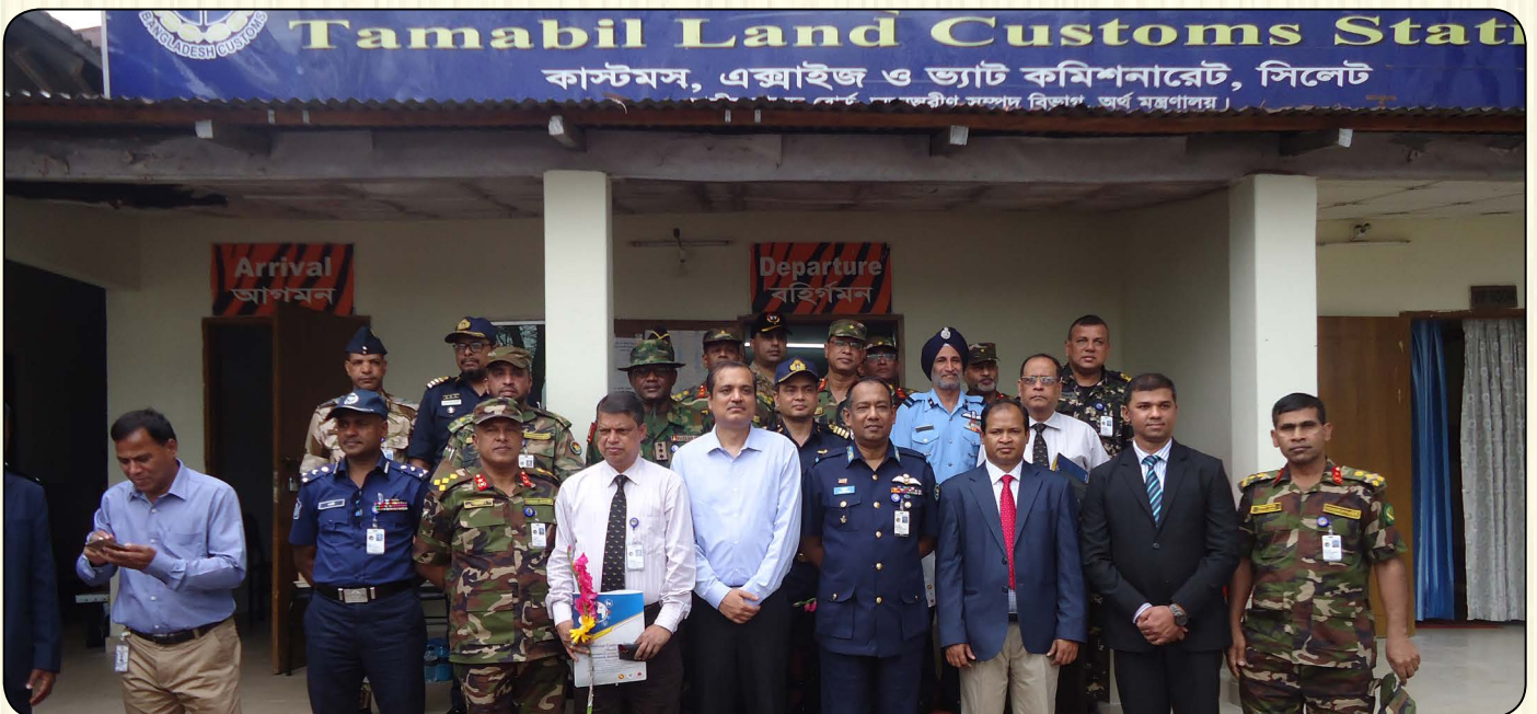
Course Members of ND Course 2018 at Tamabil Land Customs Station.

As part of course curricula Faculty Members, Staff Officers and Course Members of National Defence Course-2018 visited Barishal, Rangpur, Sylhet and Khulna area from 04 to 08 March 2018.