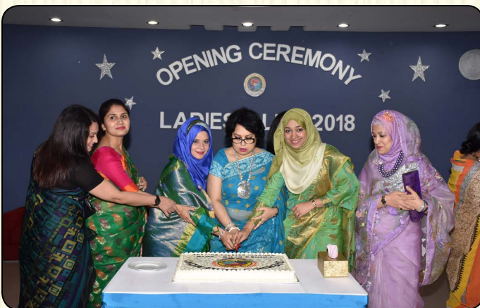
Opening Ceremony of NDC Ladies Club on 01 March 2018.