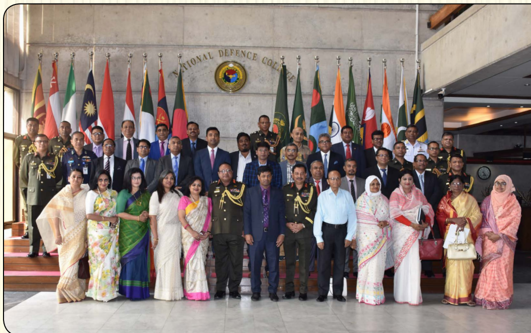
Commandant NDC along with Faculty Members, Staffs and Fellows of Capstone Course 2018-1 during the opening ceremony.

Capstone Course 2018-1 was held from 04 to 15 March 2018 at NDC. This year total 34 Fellows participated in the course. Capstone Course is designed to enhance knowledge, skill and networks related to multilateral security cooperation in Bangladesh among senior policy makers, security practitioners, judges, executives, civil society representatives, senior military officers, media personalities and other eminent personalities of the country. The intended objective of the course is to disseminate a common understanding of national security, stimulate strategic analysis and understanding of major security trends and challenges of the country taking into account both internal dynamics and external influences.