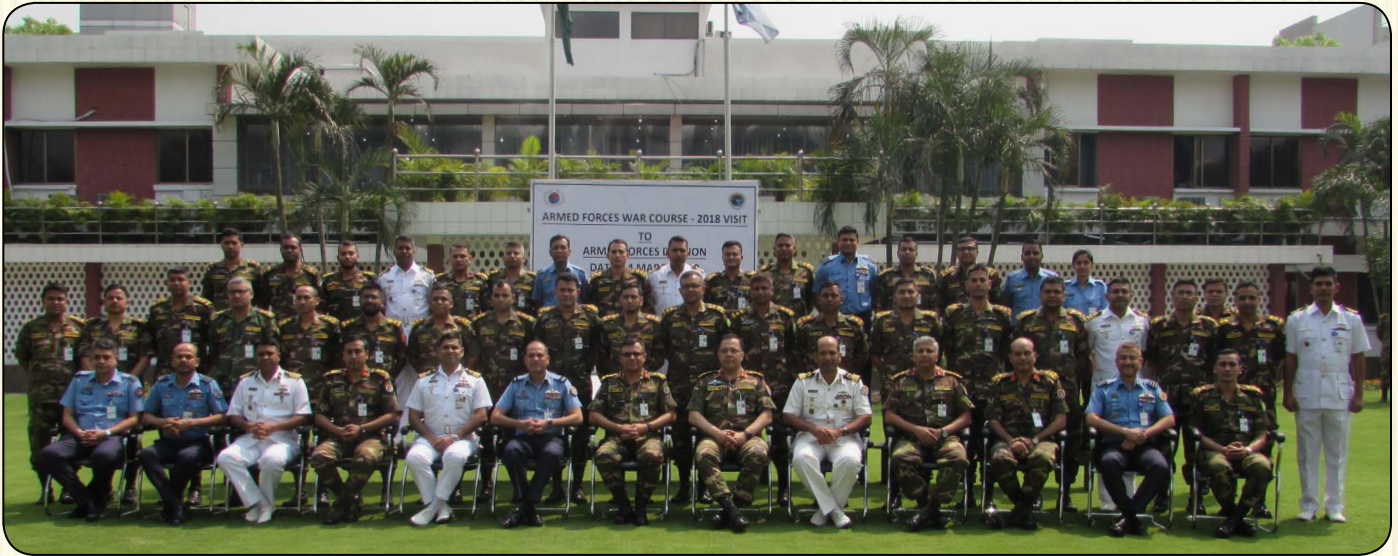
Visit to Armed Forces Division on 14 March 2018