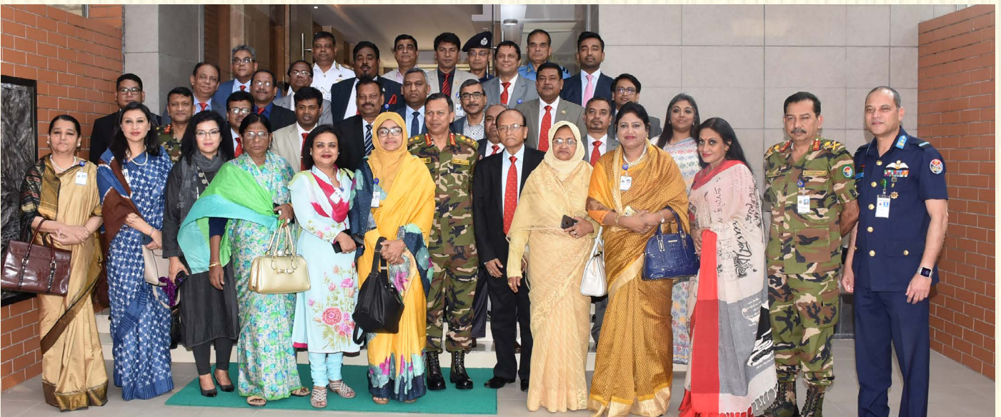
Capstone Course at Armed Forces Division

As part of course curricula Faculty Members, Staff Officers of NDC and Fellows of Capstone Course 2018-1 visited various Armed Forces installations during the course. The visit included Armed Forces Division, HQ 24 Infantry Division, Chittagong Naval Area, HQ 69 Infantry Brigade, BAF Base Bangabandhu and Bandarban Hill District Council.