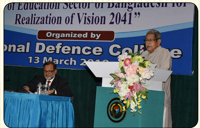
Closing Remarks by Chief Guest Professor Dr. A T M Anisuzzaman, Professor Emeritus, University of Dhaka.