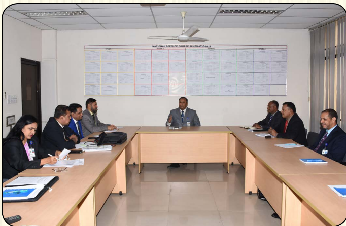
In a syndicate discussion session of ND Course.