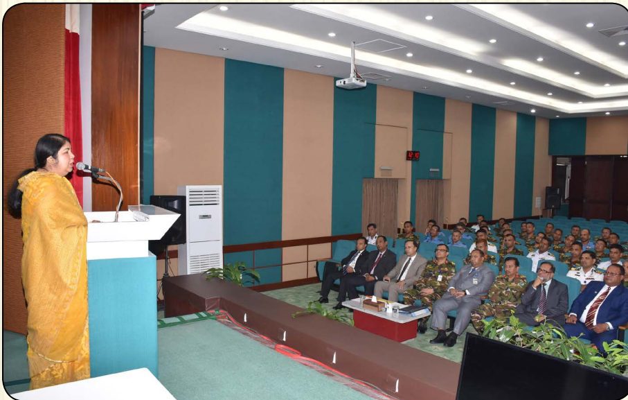
Hon'ble Speaker of National Parliament Dr. Shirin Sharmin Chaudhury, MP, delivered a lecture on "Bangladesh and its Constitution" to the Course Members of ND Course-2018 on 13 February 2018.

Professor Rehman Sobhan delivered a lecture on "Democracy and Nature of Politics in Bangladesh" to the Course Members of ND Course-2018 on 11 February 2018.