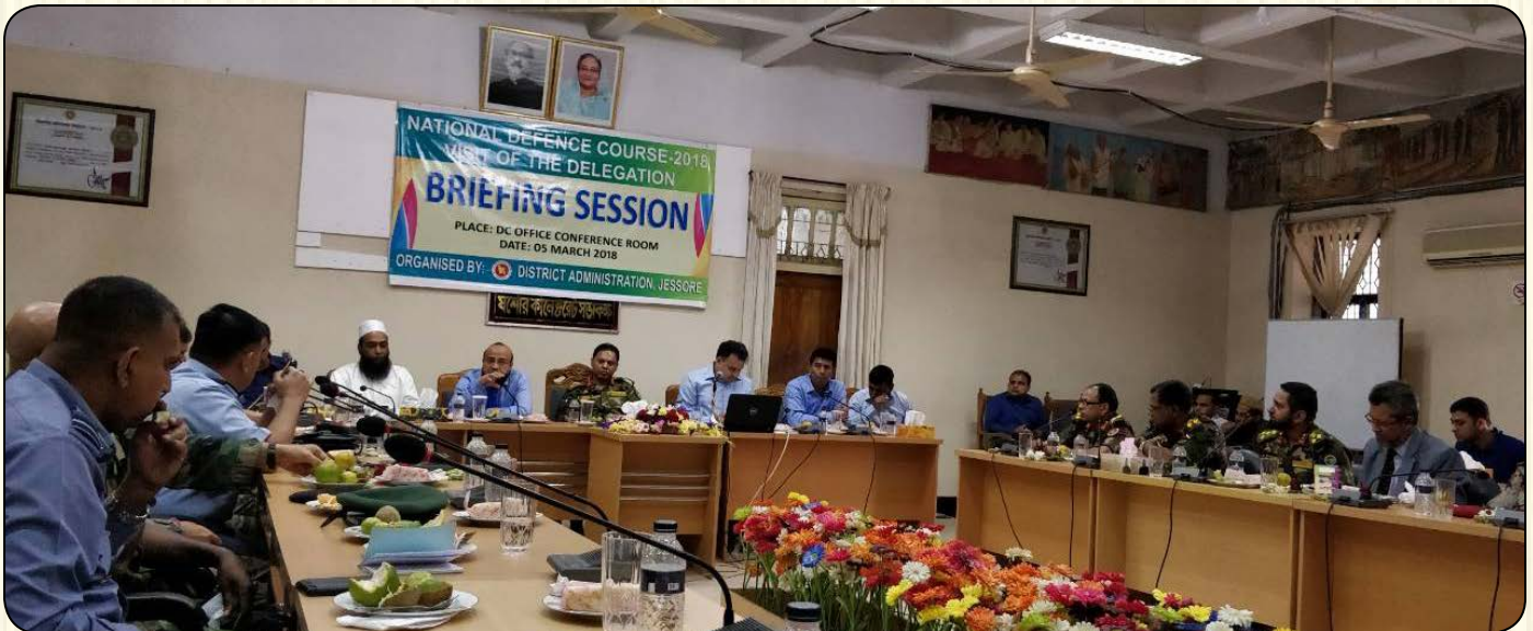
Course Members of ND Course 2018 during a briefing session at DC Office, Jashore.