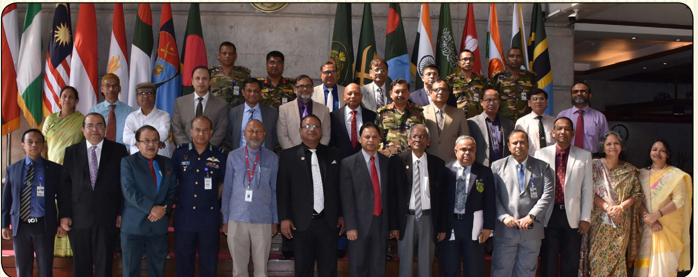
Commandant, NDC along with Faculty Members, Staff Officers and eminent Academicians of the country.

Meeting on selection of Individual Research Paper (IRP) Topic of ND Course 2018 and Nomination of Academic Advisers and Senior Directing Staffs was held on 15 February 2018. Commandant, NDC chaired the meeting in presence of Faculty Members, Staff Officers and eminent Academicians of the country.