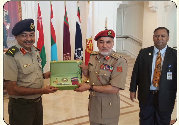
During Overseas Study Tour at Oman.