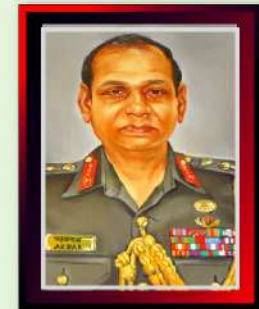
Lt Gen Mollah Fazle Akbar, ndc, psc 24 June 2011 to 16 February 2015