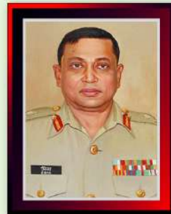
Lt Gen Sina Ibn Jamali, awc, psc 14 May 2009 to 31 Oct 2009