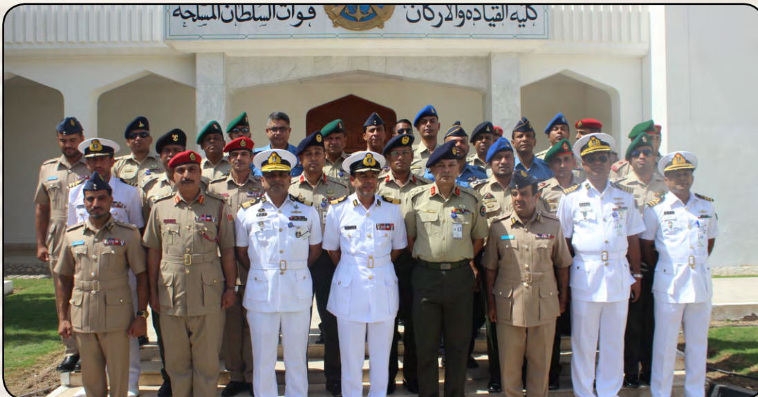
AFWC 2018 visiting delegation (Group-2) at Oman during Overseas Study Tour.