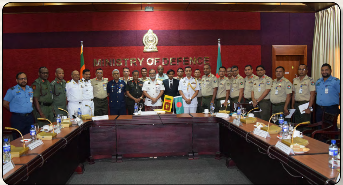
ND Course-2018 visiting delegation (Group-4) at Sri Lanka during Overseas Study Tour.