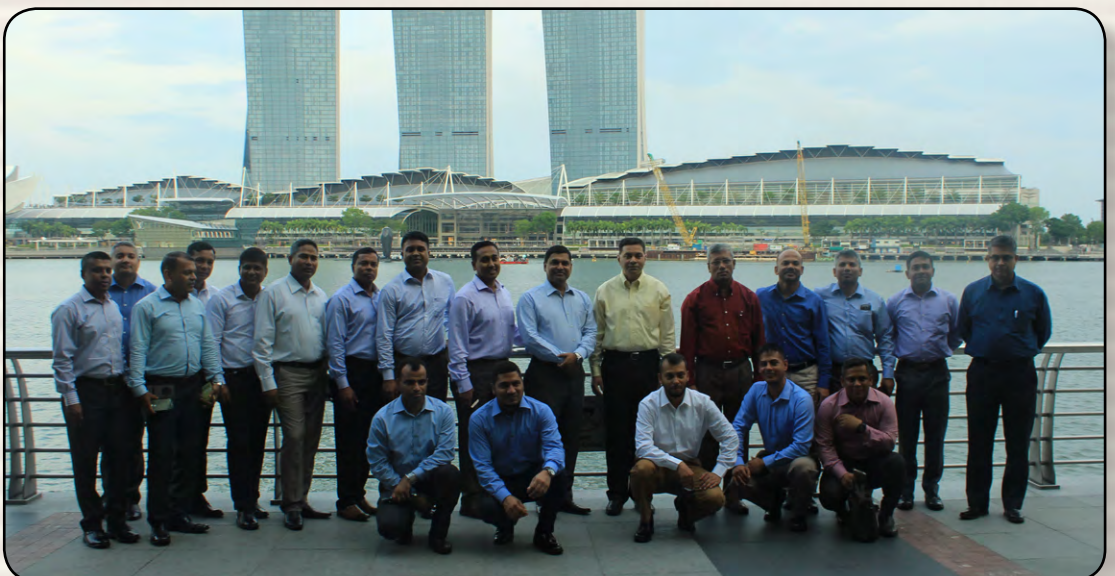
AFWC 2018 visiting delegation (Group-2) at Singapore during Overseas Study Tour.