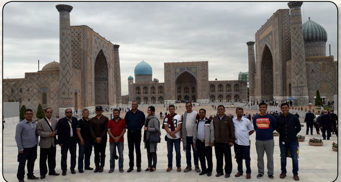
ND Course-2018 visiting delegation (Group-2) at Uzbekistan during Overseas Study Tour.