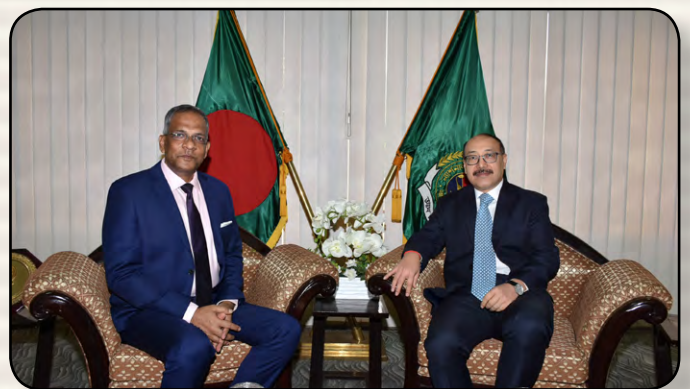
H. E. Mr. Harsh Vardhan Shringla, High Commissioner of India to Bangladesh visited NDC and called on Commandant, NDC on 13 August 2018.