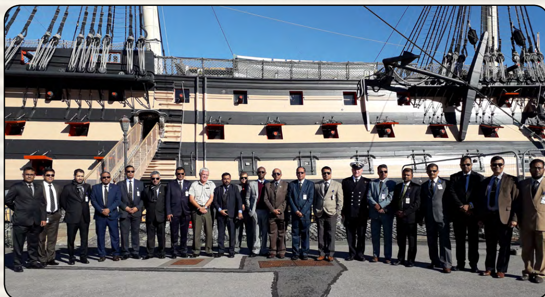
ND Course-2018 visiting delegation (Group-2) at UK during Overseas Study Tour.