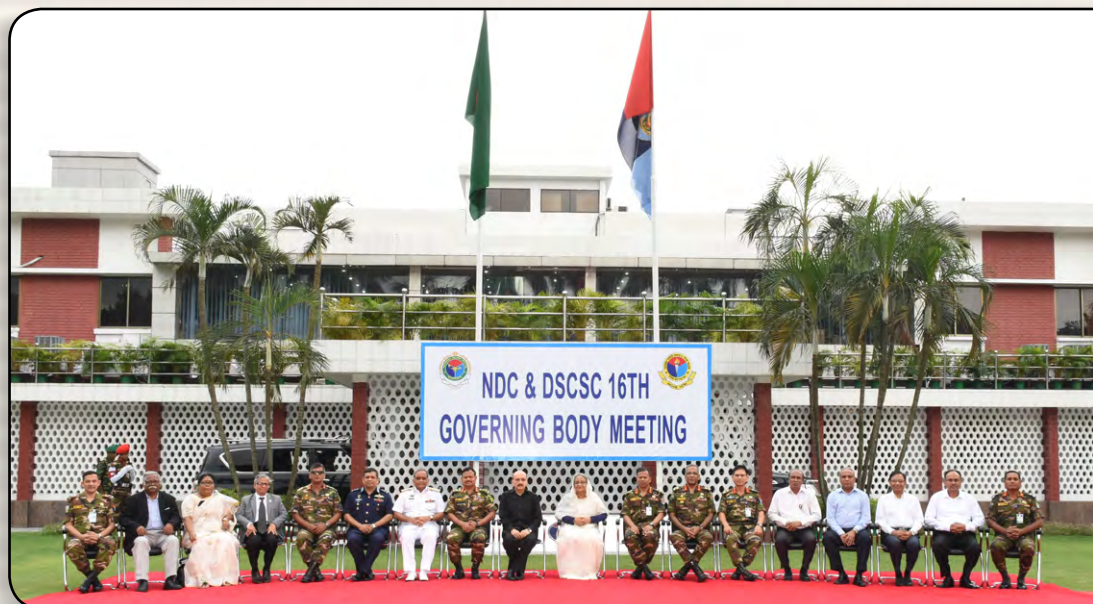
16th Governing Body Meeting of NDC and DSCSC on 12 August 2018.

The Governing Body of National Defence College is the highest policy making body related to all aspects of the college. The Governing Body is headed by the Honourable Prime Minister of the Government of the People's Republic of Bangladesh. The Security Adviser to the Honourable Prime Minister and Chiefs of three services act as the Senior Vice President and Vice Presidents of the Governing Body respectively. Governing Body sits once in a year to formulate policy and provide directives in order to ensure smooth functioning of the college. The other distinguished members are Commandant NDC, Principal Staff Officer, Armed Forces Division, Commandant Defence Services Command and Staff College, five Secretaries of different ministries of the Government and four Vice Chancellors of public universities.