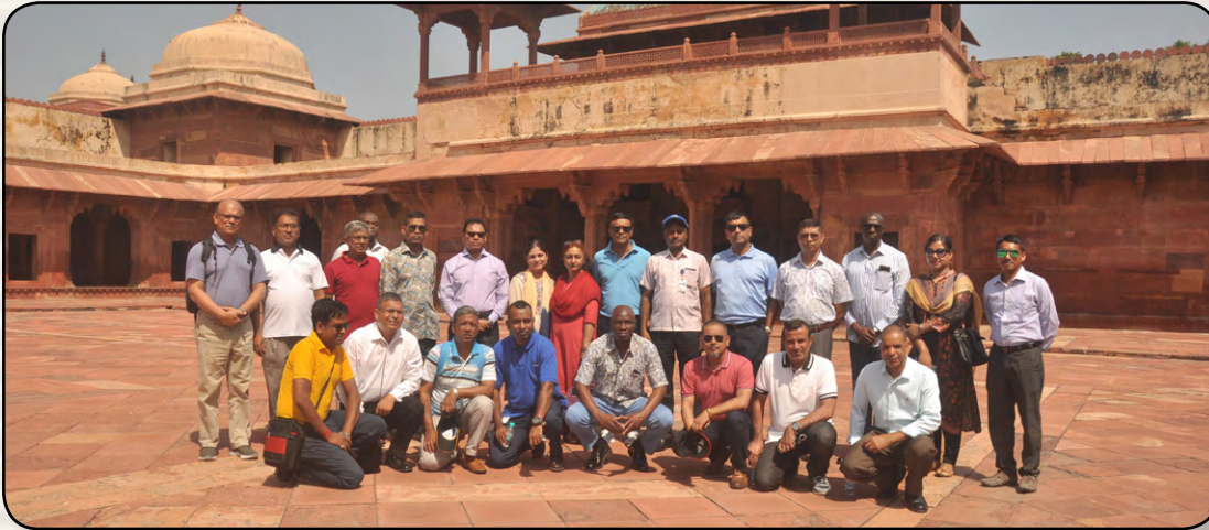
ND Course-2018 visiting delegation (Group-1) at India during Overseas Study Tour.

Course Members of National Defence Course 2018 along with Faculty and Staff Officers visited 12 countries in four groups. Group - 1 visited India, Indonesia, Japan; Group - 2 visited Maldives, Uzbekistan, UK; Group - 3 visited Bhutan, Turkey, Poland and Group - 4 visited China, Sri Lanka, UAE.