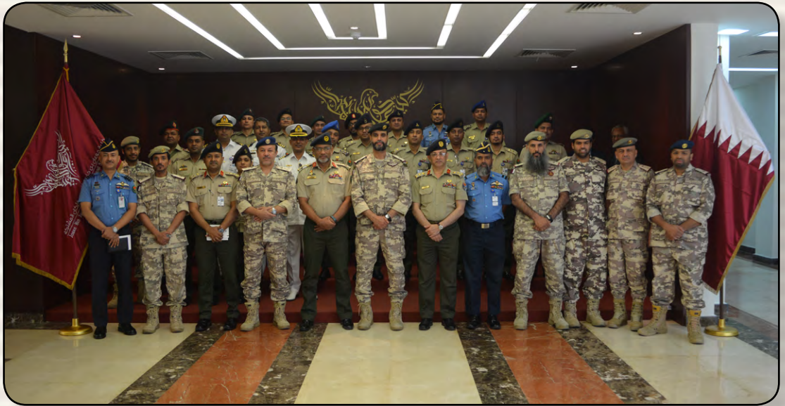
AFWC 2018 visiting delegation (Group-1) at Qatar during Overseas Study Tour.