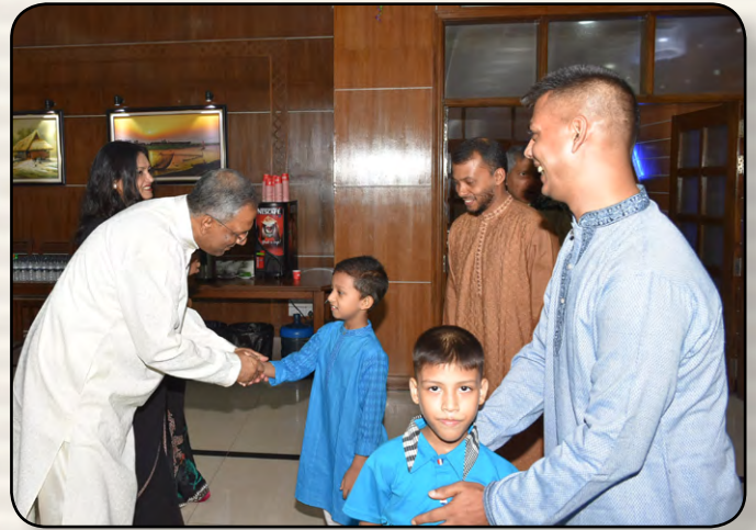
Eid ul Azha reception at NDC on 22 August 2018.