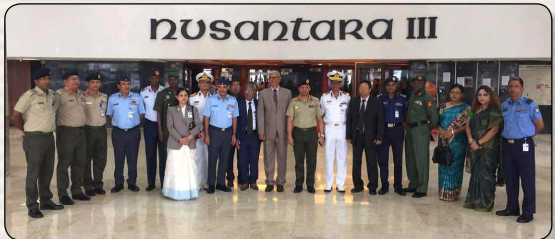
ND Course-2018 visiting delegation (Group-1) at Indonesia during Overseas Study Tour.