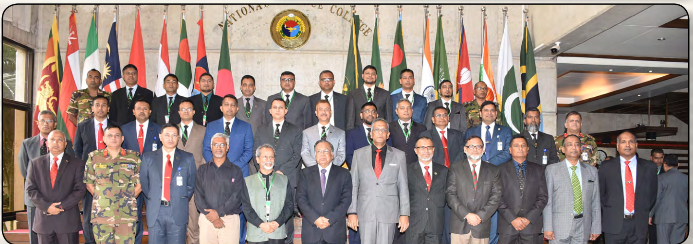
The Chief Guest along with Commandant NDC, Faculty Members, Keynote Speakers during the seminar on 05 September 2018 at NDC, Mirpur