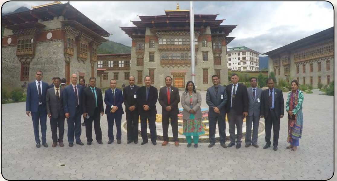
ND Course-2018 visiting delegation (Group-3) at Bhutan during Overseas Study Tour.