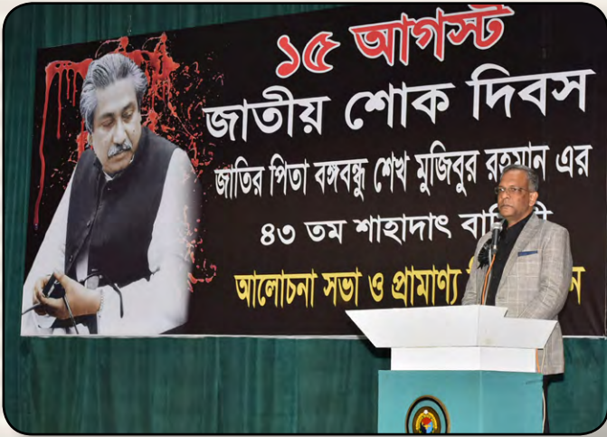
National Mourning Day observed at NDC on 15 August 2018.