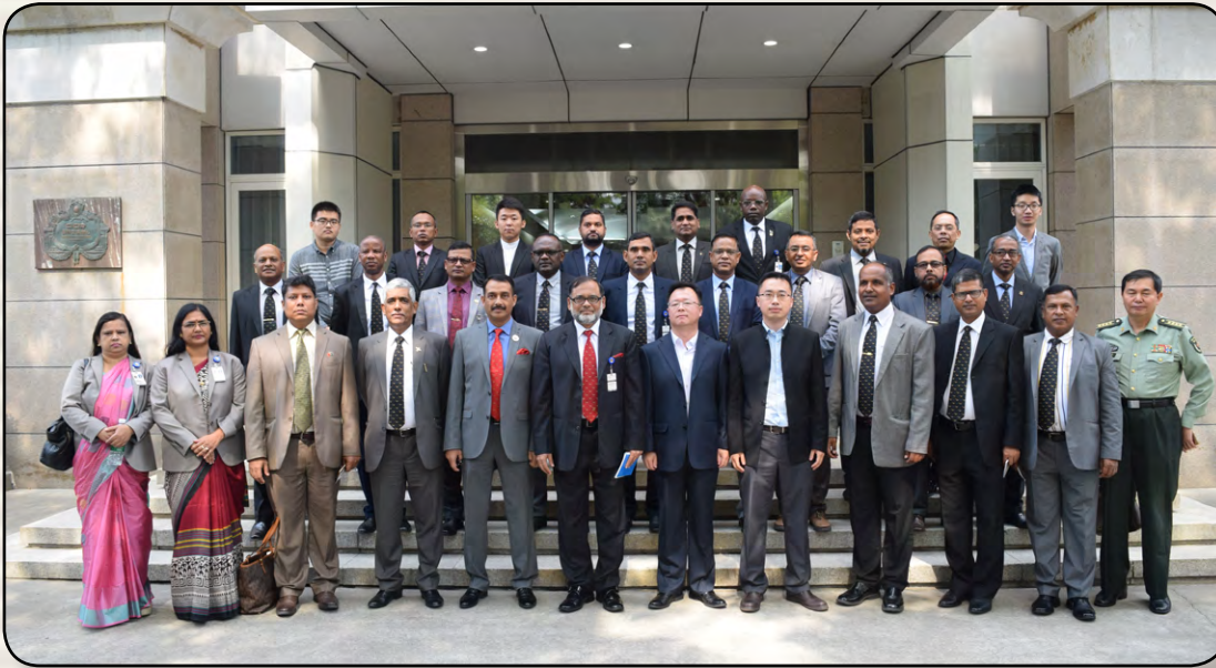
ND Course-2018 visiting delegation (Group-4) at China during Overseas Study Tour.