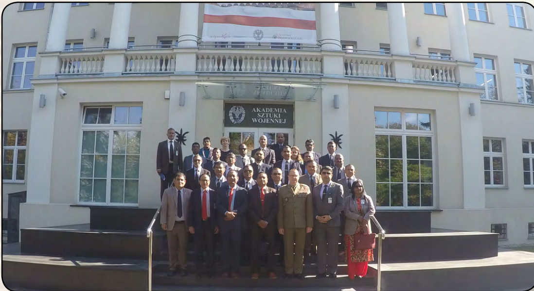
ND Course-2018 visiting delegation (Group-3) at Poland during Overseas Study Tour.