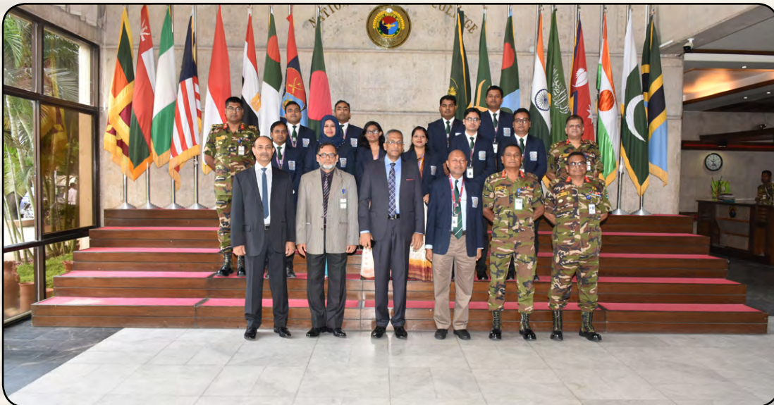
Vice Chancellor along with his team from Begum Rokeya University, Rangpur, visited NDC on 16 August 2018.