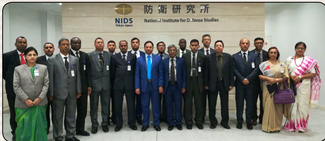
ND Course-2018 visiting delegation (Group-1) at Japan during Overseas Study Tour.