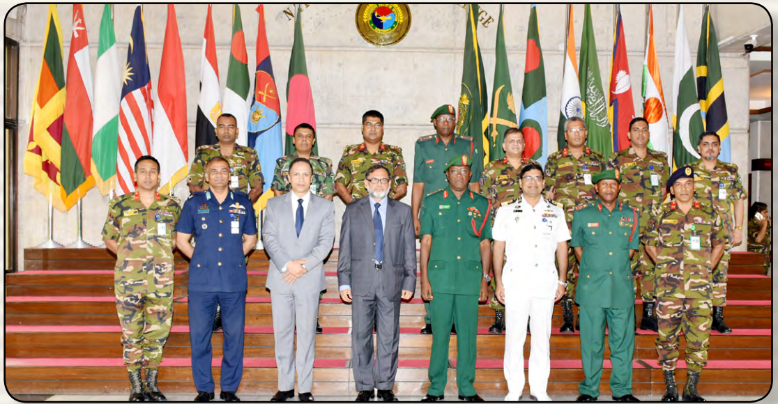
A Delegation from National Defence College Tanzania visited NDC on 31 July 2018.