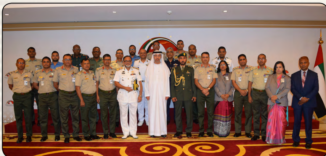
ND Course-2018 visiting delegation (Group-4) at UAE during Overseas Study Tour.