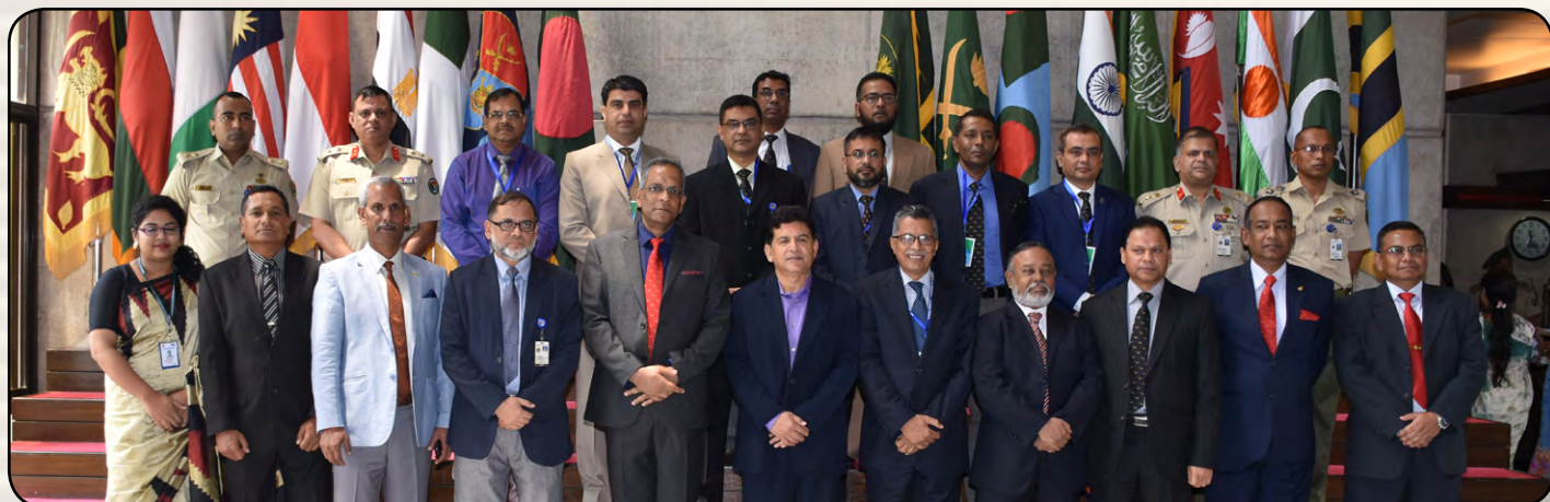
The Chief Guest along with Commandant NDC, Faculty Members, Keynote Speakers during the seminar on 03 September 2018 at NDC, Mirpur