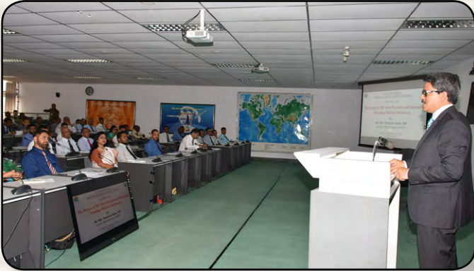
Mr. Md Shahriar Alam, MP, Hon'ble State Minister for Foreign Affairs delivered a lecture on "The Future of International Relations: New Frontiers and Emerging Paradigm Shifts in Diplomacy" to the Course Members of ND Course-2018 on 19 July 2018.