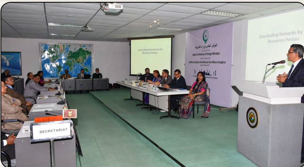
Course Members of ND Course-2018 attended "Exercise Art of Negotiation" on 09 August 2018, where they practiced negotiation in an international scenario.