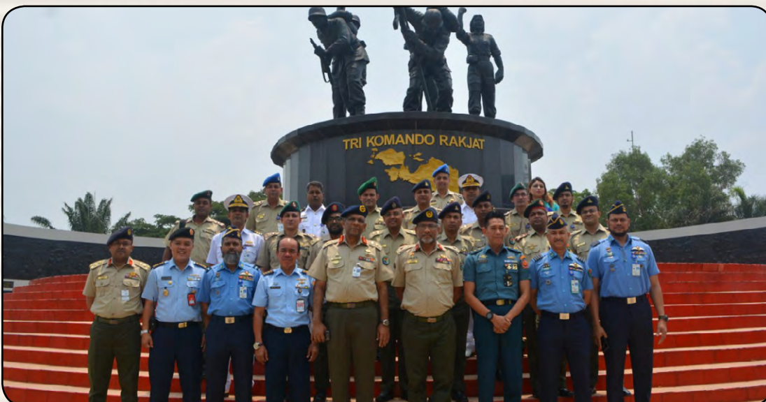
AFWC 2018 visiting delegation (Group-1) at Indonesia during Overseas Study Tour.

Course Members of Armed Forces War Course 2018 along with Faculty and Staff Officers visited 4 countries in two groups. Group - 1 visited Indonesia and Qatar; Group - 2 visited Oman and Singapore.