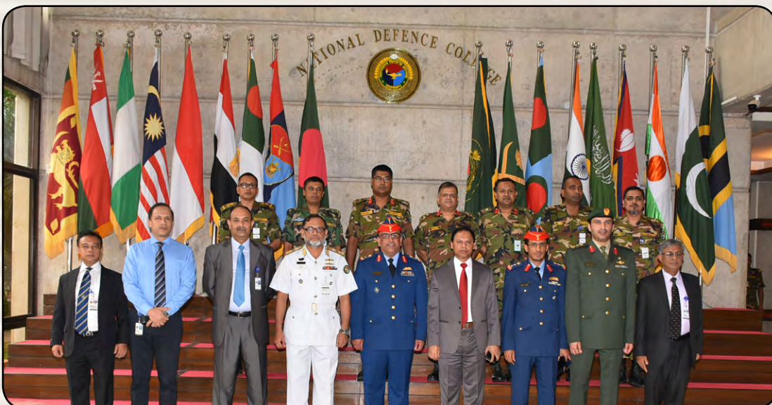
A Delegation from UAE Army visited NDC on 03 July 2018.