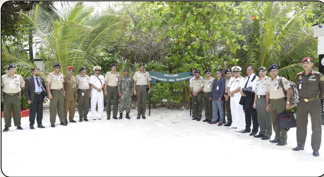
ND Course-2018 visiting delegation (Group-2) at Maldives during Overseas Study Tour.