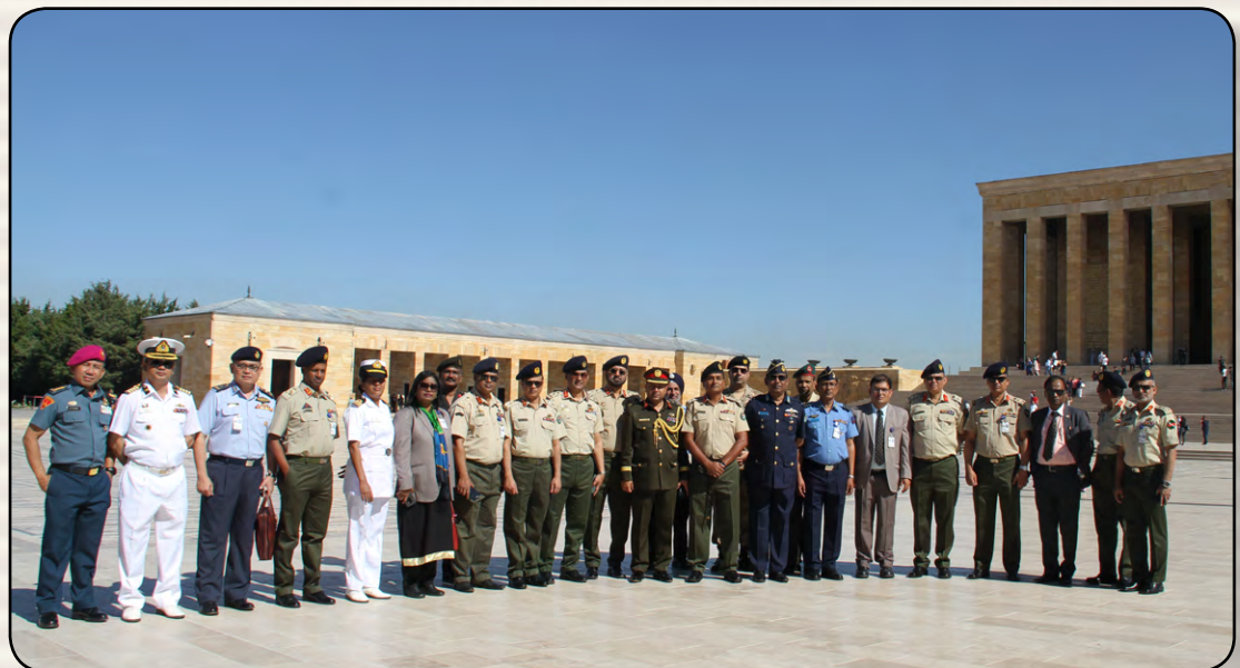
ND Course-2018 visiting delegation (Group-3) at Turkey during Overseas Study Tour.