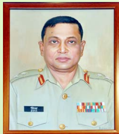
Lt Gen Sina Ibn Jamali, awc, psc 14 May 2009 to 31 Oct 2009