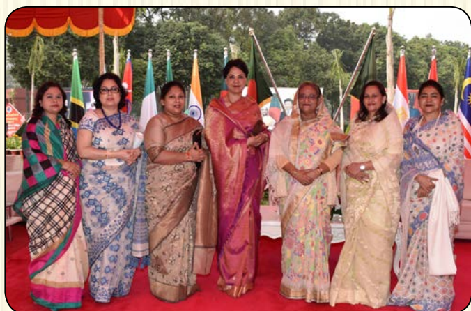
Hon'ble Prime Minister with the spouses of Senior Armed Forces Officers during the Graduation Ceremony.