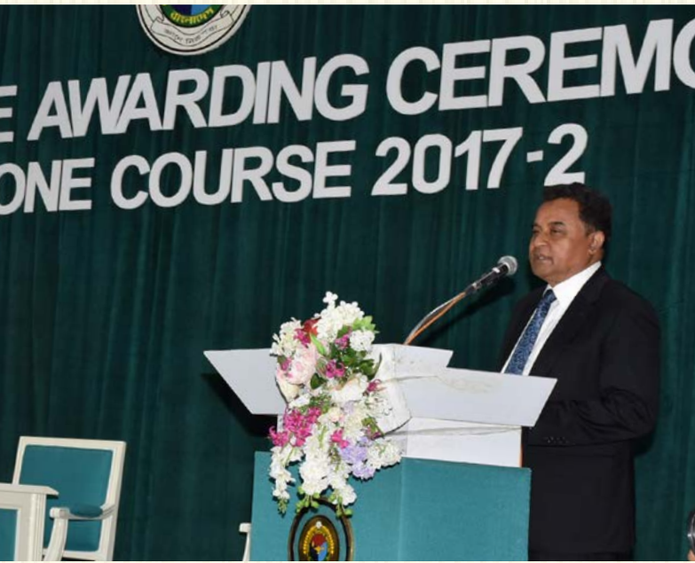
Mr. A H M Mustafa Kamal, MP, Hon'ble Minister, Ministry of Planning graced the Certificate Awarding ceremony as the Chief Guest and distributed certificates among the Capstone Fellows on 02 November 2017.