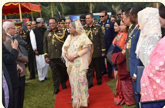
The Hon'ble Prime Minister interacting with the guests during the Graduation Ceremony of National Defence Course and Armed Forces War Course on 18 December 2017.