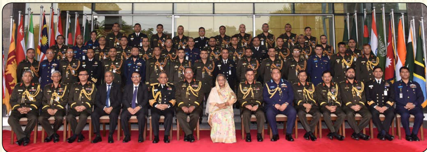
Hon'ble Prime Minister of the Government of the People's Republic of Bangladesh, Sheikh Hasina along with Commandant, Faculty Members and Course Members of Armed Forces War Course 2017 during the Graduation Ceremony on 18 December 2017.