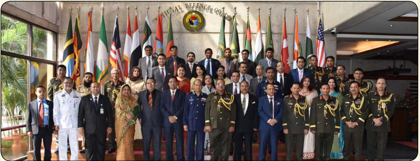
Commandant NDC along with Faculty Members, Staff Officers and Fellows of Capstone Course 2017-2 during the Opening Ceremony.

NDC conducted Capstone Course 2017-2 from 22 October to 02 November 2017. A total of 30 Fellows participated in the course. Capstone Course is designed to enhance knowledge, skill and networks related to multilateral security cooperation in Bangladesh among senior policy makers, security practitioners, judges, executives, civil society representatives, senior military officers, media personalities and other eminent personalities of the country. The intended objective of the course is to disseminate a common understanding of national security, stimulate strategic analysis and understanding of major security trends and challenges of the country taking into account both internal dynamics and external influences.