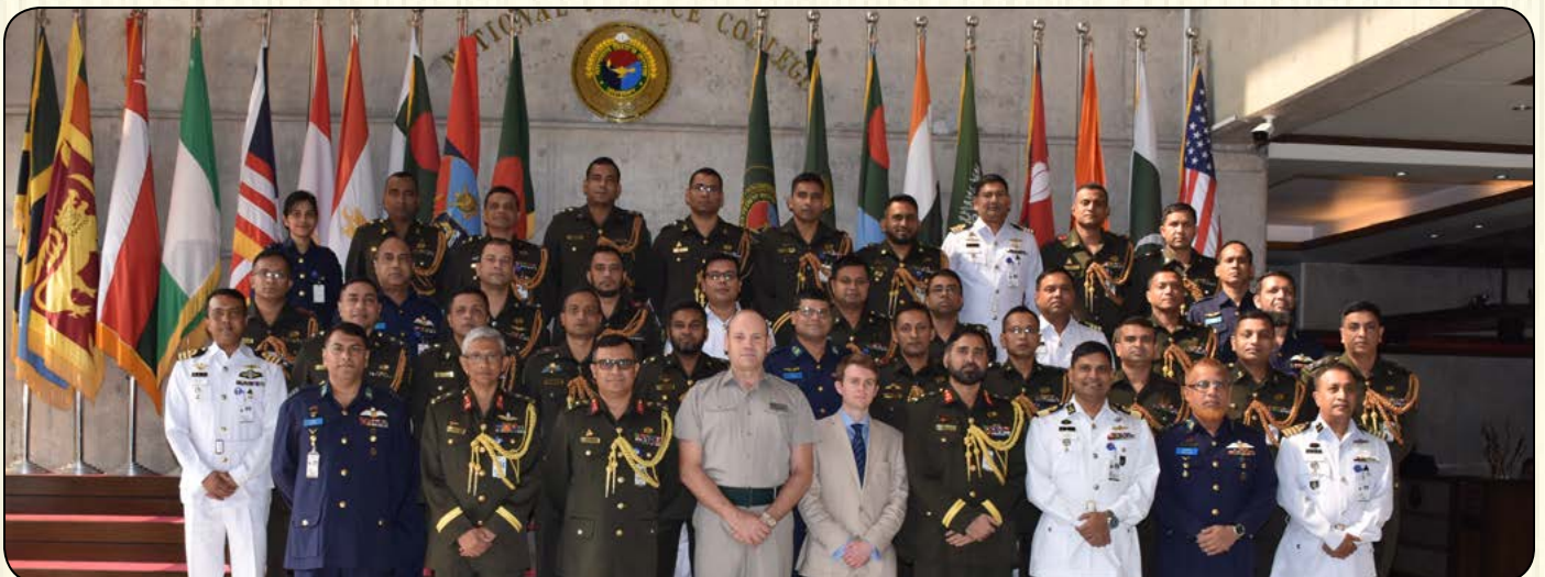
The delegation of the Defence Academy of UK along with Faculty and Course Members of Armed Forces War Course during visit to NDC, Bangladesh. The UK delegation conducted Strategic Leadership Programme for Armed Forces War Course-2017 on 19 November 2017.