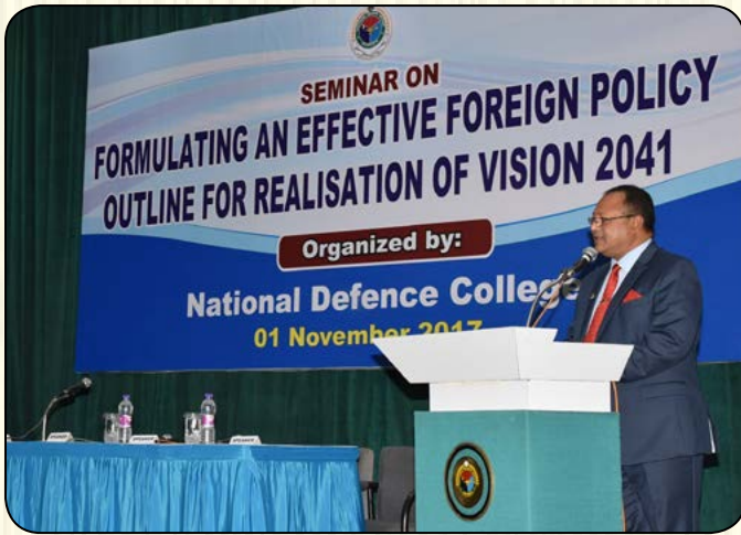
Commandant NDC, delivering Welcome Address at the seminar on 01 November 2017.