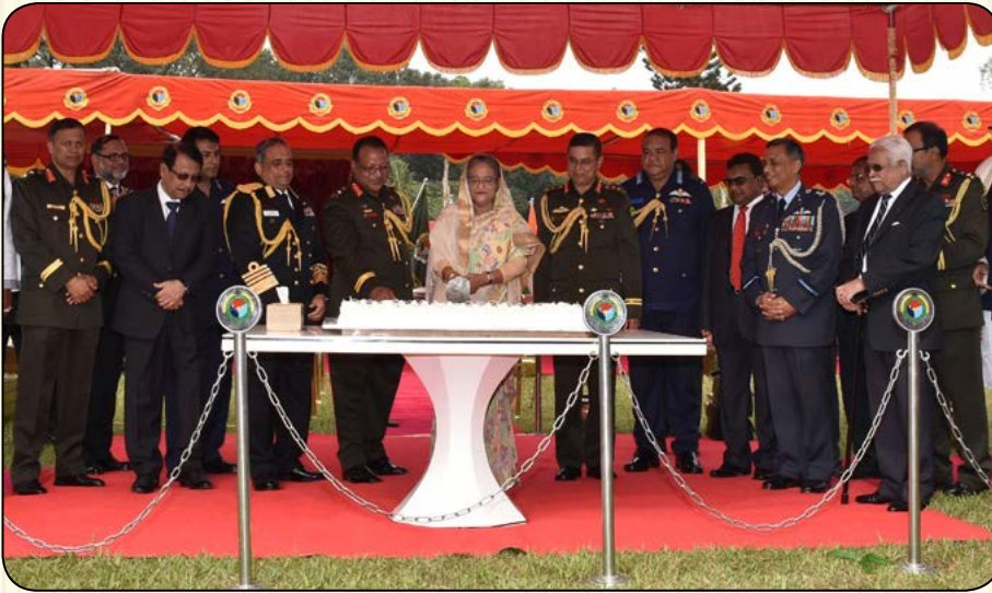
Hon'ble Prime Minister is knifing the Graduation Cake during the Graduation Ceremony on 18 December 2017.