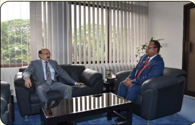
Maj Gen Tarique Ahmed Siddique, rcds, psc (Retd), Adviser to the Hon'ble Prime Minister (Security Affairs) visited NDC and called on Commandant, NDC on 15 October 2017.