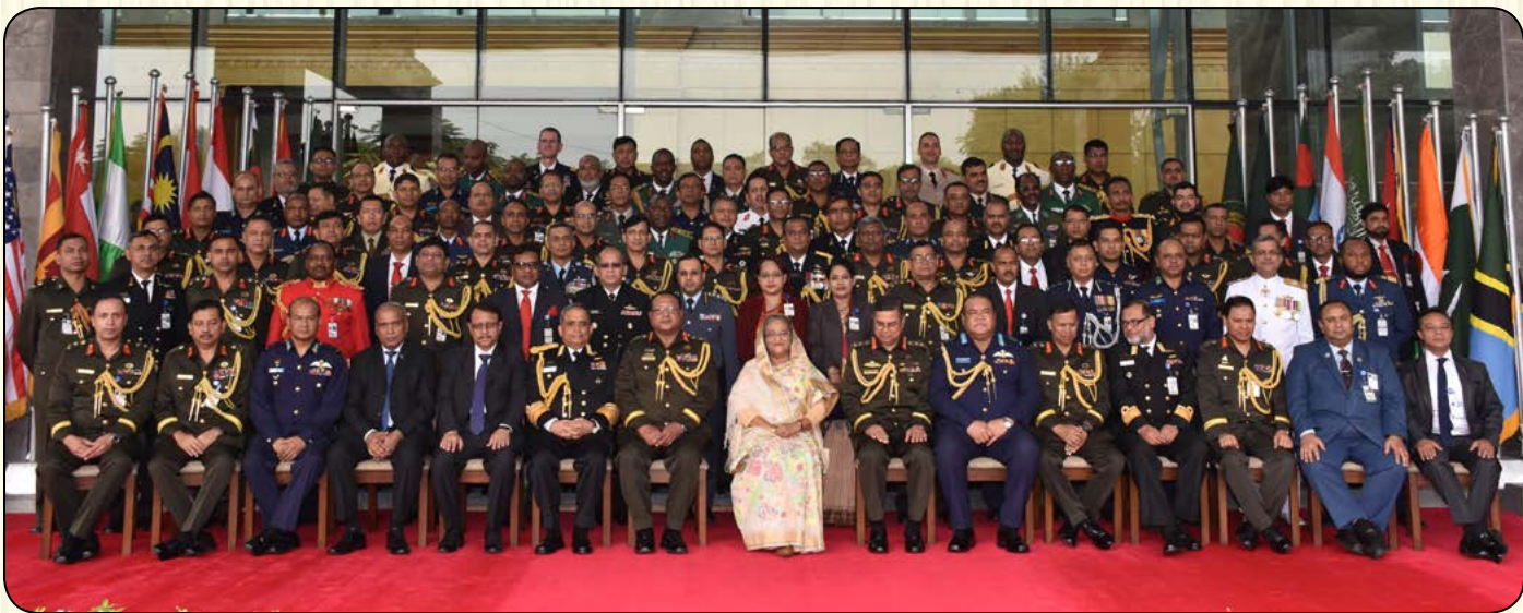
Hon'ble Prime Minister of the Government of the People's Republic of Bangladesh, Sheikh Hasina along with Commandant, Faculty Members and Course Members of National Defence Course 2017 during the Graduation Ceremony on 18 December 2017.