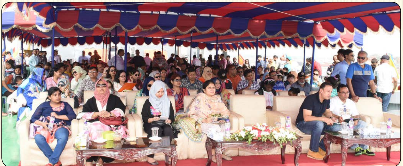
A segment of the Course Members of National Defence Course and Armed Forces War Course-2017 during the river cruise on River Buriganga-Meghna on 09 November 2017. It was a day of witnessing the scenic beauty alongside the river.