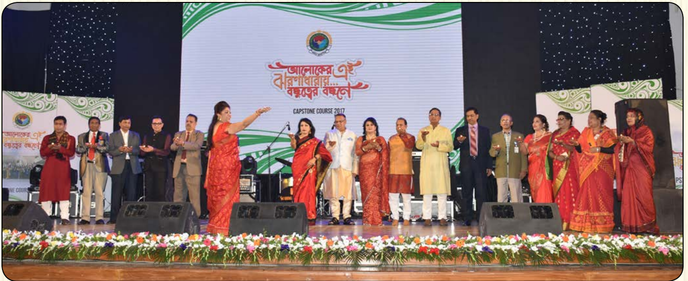
“Social Night and Capstone Alumni Reunion”, a gala event of Capstone Course 2017-2 held on 02 November 2017 at Kurmitola Golf Club. Commandant, Faculty Members, Staff Officers and all the Fellows of Capstone Course 2017-2 attended the occasion. A good number of Capstone Alumni also gathered during the event.