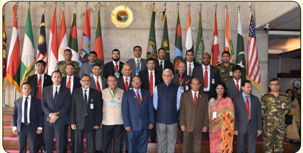
The Chief Guest along with Commandant NDC, Faculty Members and Keynote Paper Presenters at the seminar on 01 November 2017.