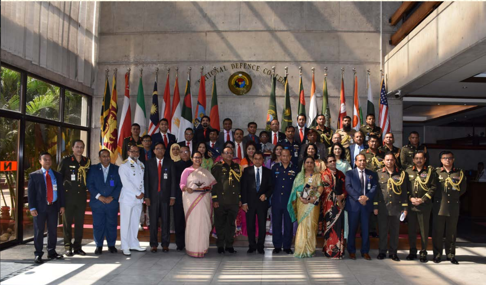
The Chief Guest, Mr. A H M Mustafa Kamal, MP, Hon'ble Minister, Ministry of Planning along with Commandant NDC, Faculty Members, Staff Officers and Fellows of Capstone Course 2017-2 during the Closing Ceremony of Capstone Course 2017-2 on 02 November 2017.