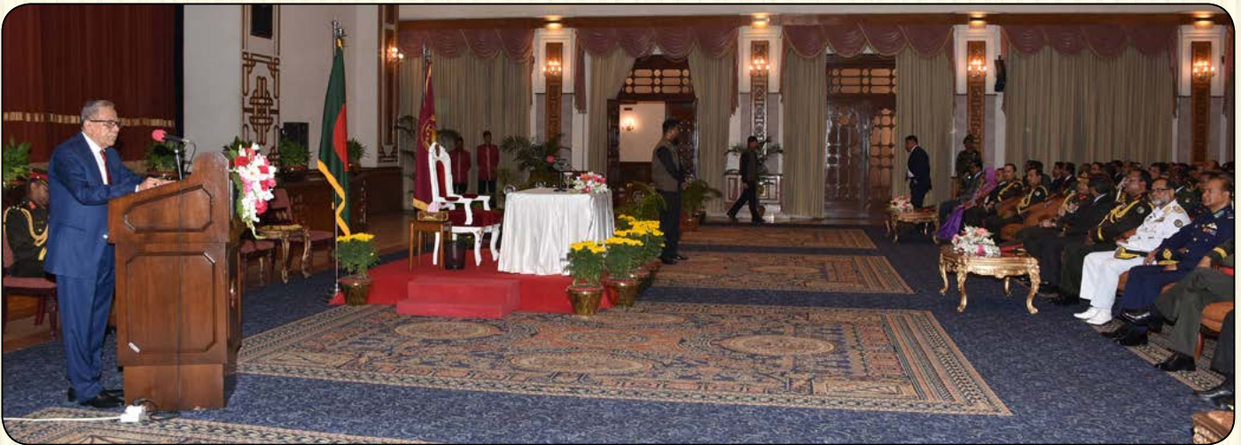
Hon'ble President of the Peoples' Republic of Bangladesh addressing the Course Members of National Defence Course and Armed Forces War Course-2017 during visit to Bangabhaban on 06 December 2017.