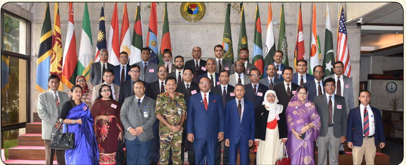
Course Members of 83rd Senior Staff Course of Bangladesh Public Administration Training Centre (BPATC) visited NDC on 24 October 2017.