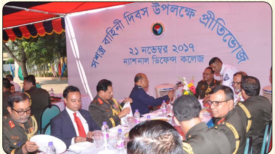
The Feast (Pritivoj) arranged on the Armed Forces Day on 21 November 2017.