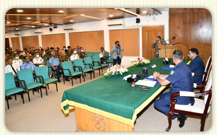
Faculty Members, Staff Officers and Course Members of National Defence Course 2022 visited Bangladesh Institute of International and Strategic Studies (BIISS) on 28 April 2022.