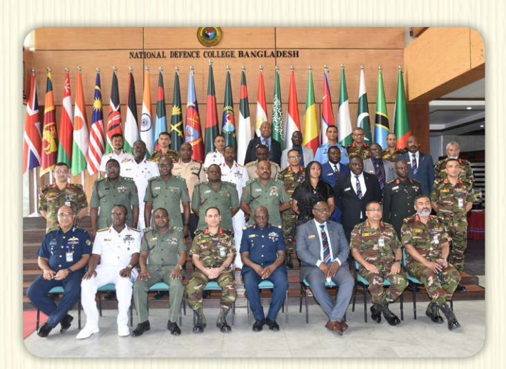
A Delegation from National Defence College, Nigeria visited NDC on 07 June 2022.