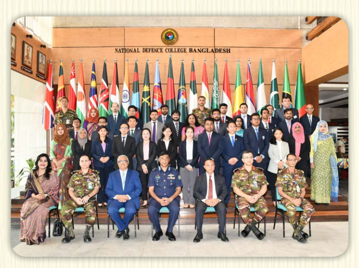
A Delegation from Bangladesh Foreign Service Academy visited NDC on 30 May 2022.