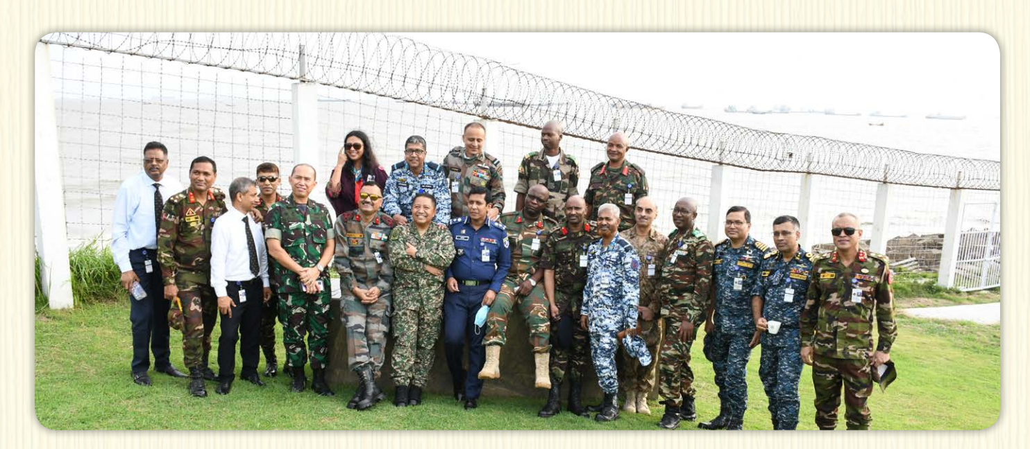
BNA West Point, Potenga