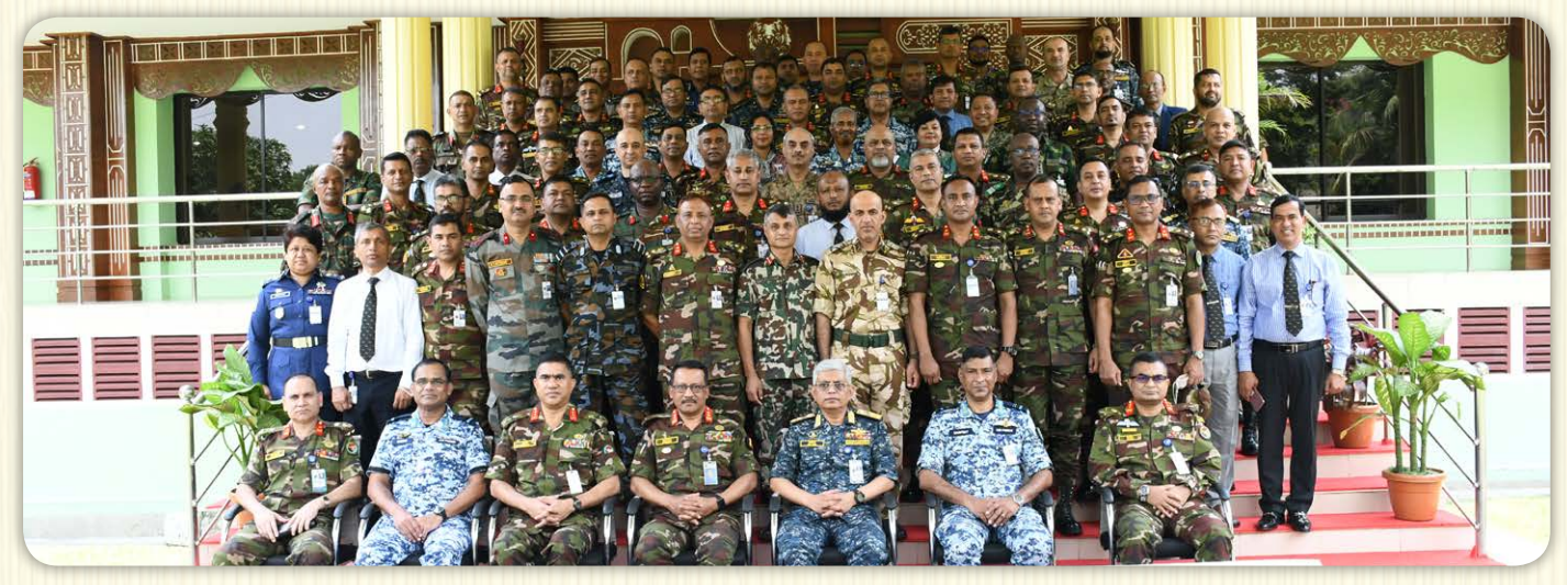
Headquarters 24 Infantry Division

As part of course curricula Faculty Members, Staff Officers and Course Members of National Defence Course-2022 visited Chattogram, Bandarban and Cox's Bazar area from 06 June to 10 June 2022.