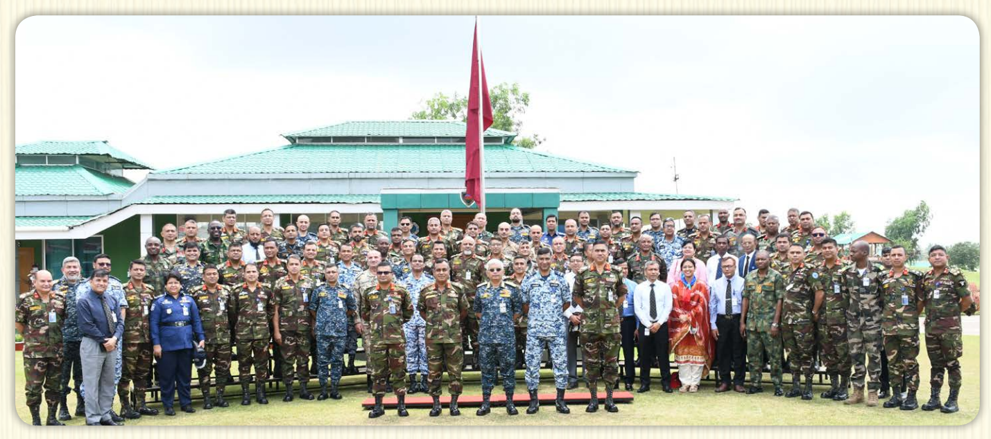
Headquarters 10 Infantry Division