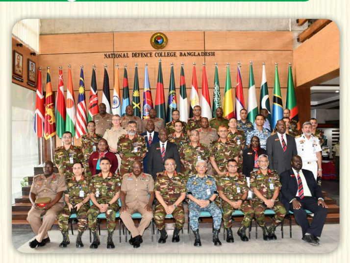
A Delegation from National Defence College, Kenya visited NDC on 11 April 2022.