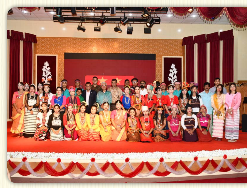
Cultural Program at Bandarban