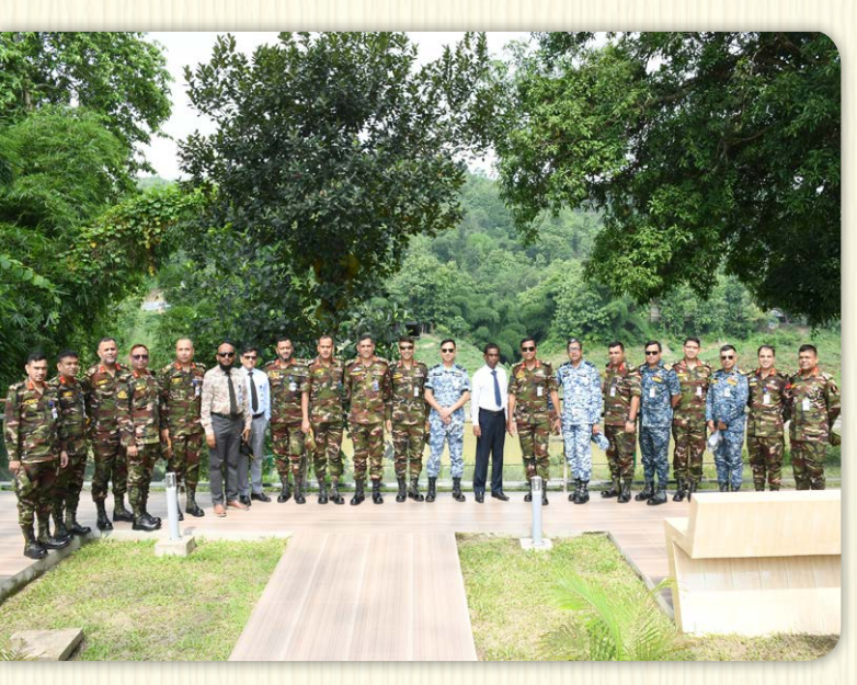
HQ 69 Infantry Brigade