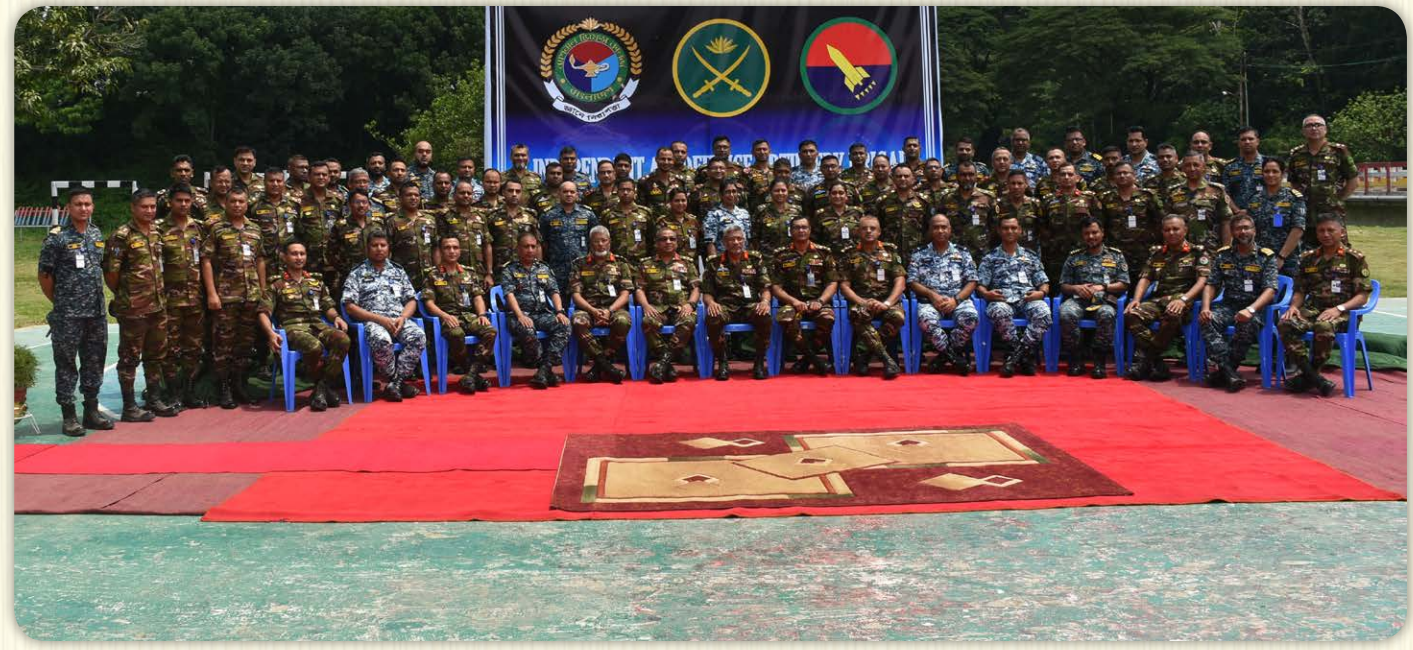
Page # 12