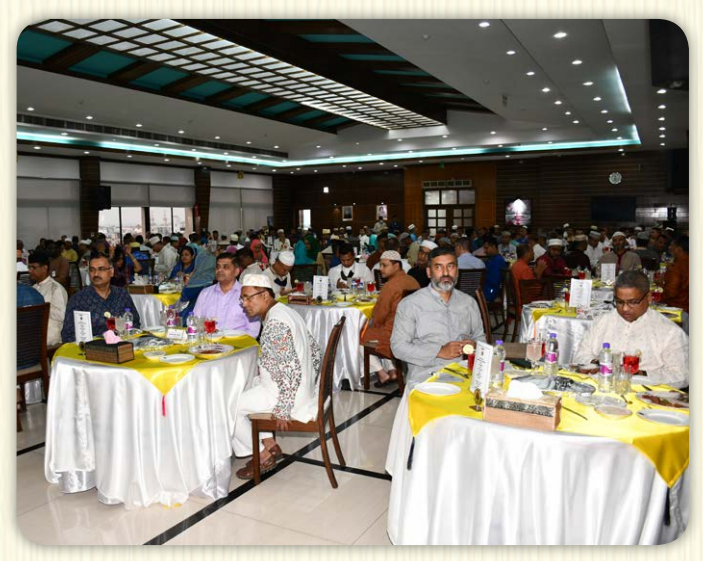
Iftar Party on 19 April 2022