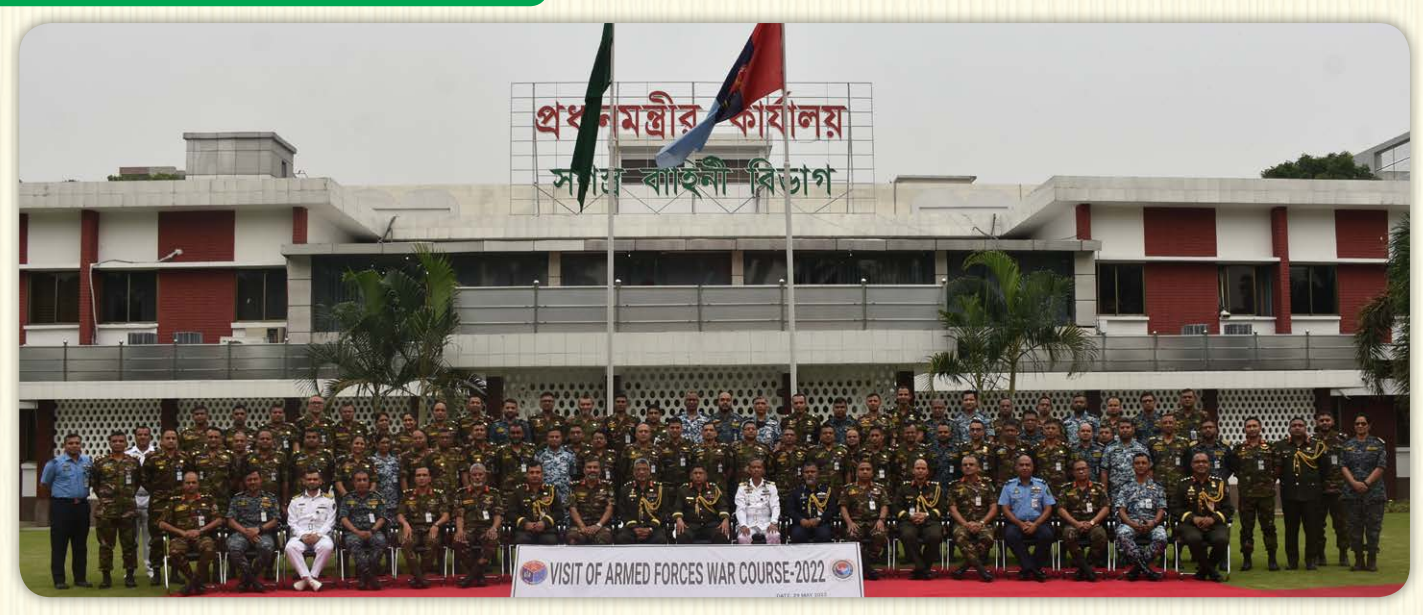
Faculty Members, Staff Officers and Course Members of Armed Forces War Course 2022 visited Armed Forces Division on 29 May 2022.