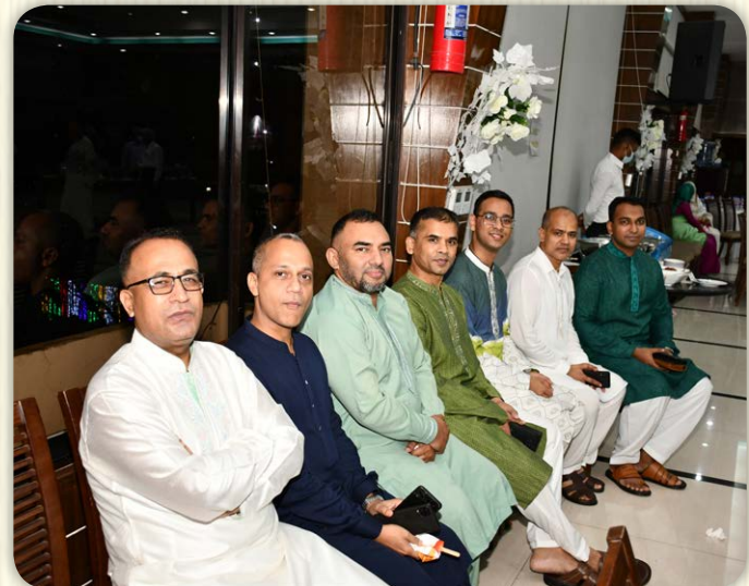
Commandant Call on (Eid ul Fitr) on 03 May 2022