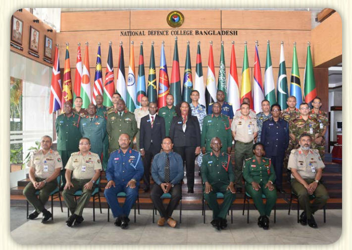
A Delegation from National Defence College, Tanzania visited NDC on 09 June 2022.