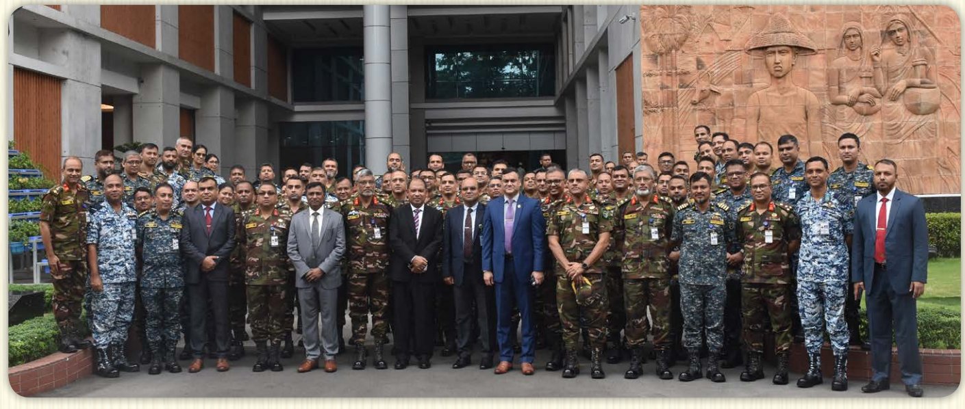
Faculty Members, Staff Officers and Course Members of Armed Forces War Course 2022 visited NSI Office on 01 June 2022. Page # 10