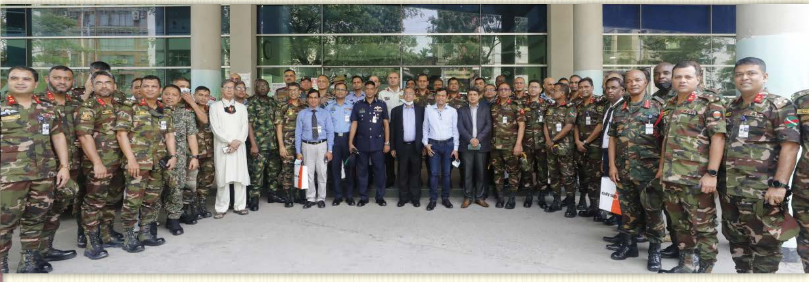
Faculty Members, Staff Officers and Course Members of National Defence Course 2022 visited Daily Sun and Independent Television on 06 April 2022.