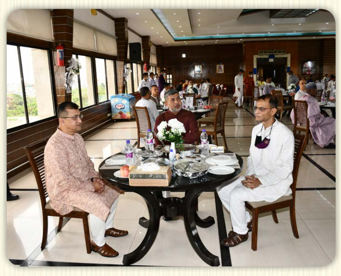
Eid Pritivoj (Eid ul Fitr) on 03 May 2022