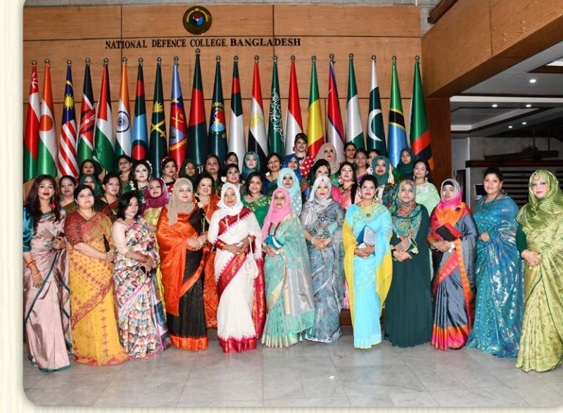
NDC Ladies Club organized a programme on 02 June 2022.