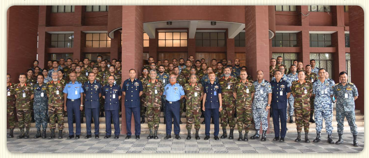
Faculty Members, Staff Officers and Course Members of Armed Forces War Course 2022 visited Air Headquarters on 04 April 2022.