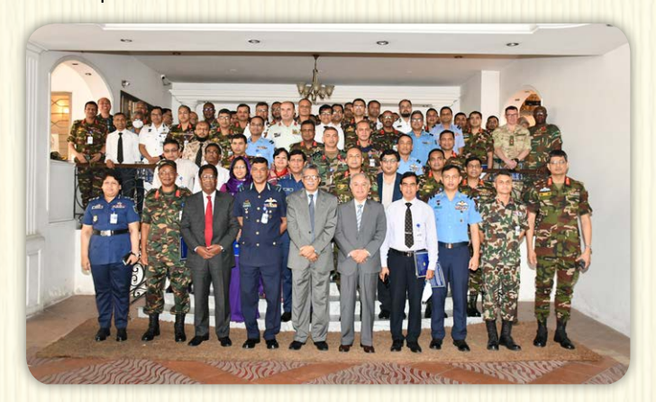
Faculty Members, Staff Officers and Course Members of National Defence Course 2022 visited Bangladesh Enterprise Institute (BEI) on 28 April 2022.