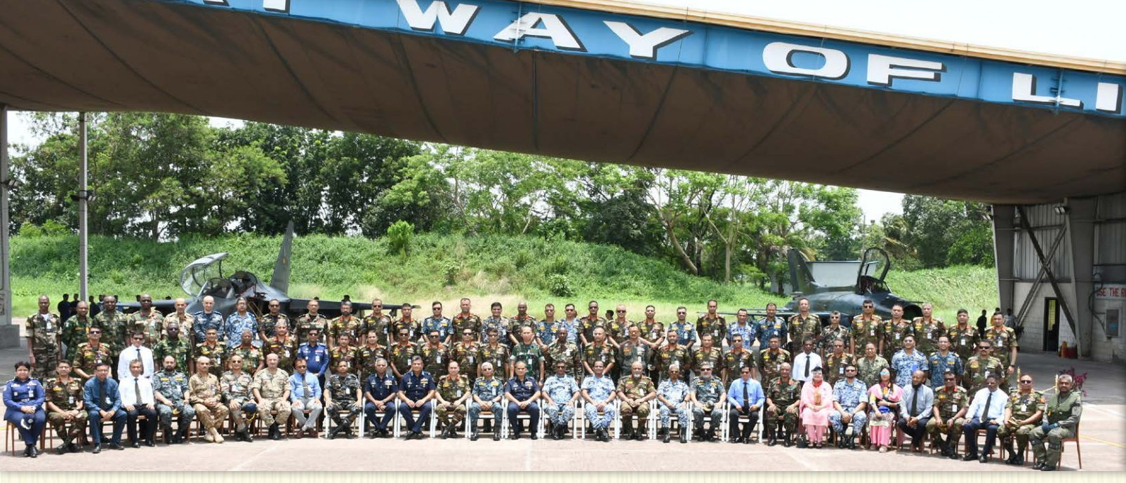
BAF Base Zahurul Haque, Chattogram